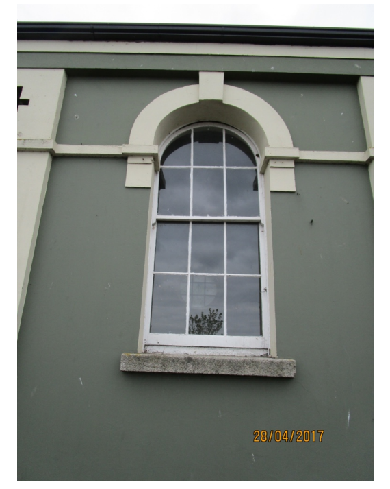
Plate 7. Window on North elevation. These timber sash windows will be repaired and re-decorated.