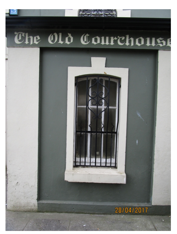
Plate 4 Porch window on west elevation.