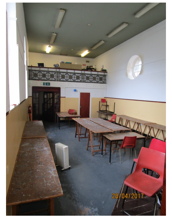
Plate 8. Interior of main hall looking East to mezzanine floor. A small tea station and store is proposed under this balcony, which will involve the addition of 2no. new doors to match the existing four panel doors within the building.