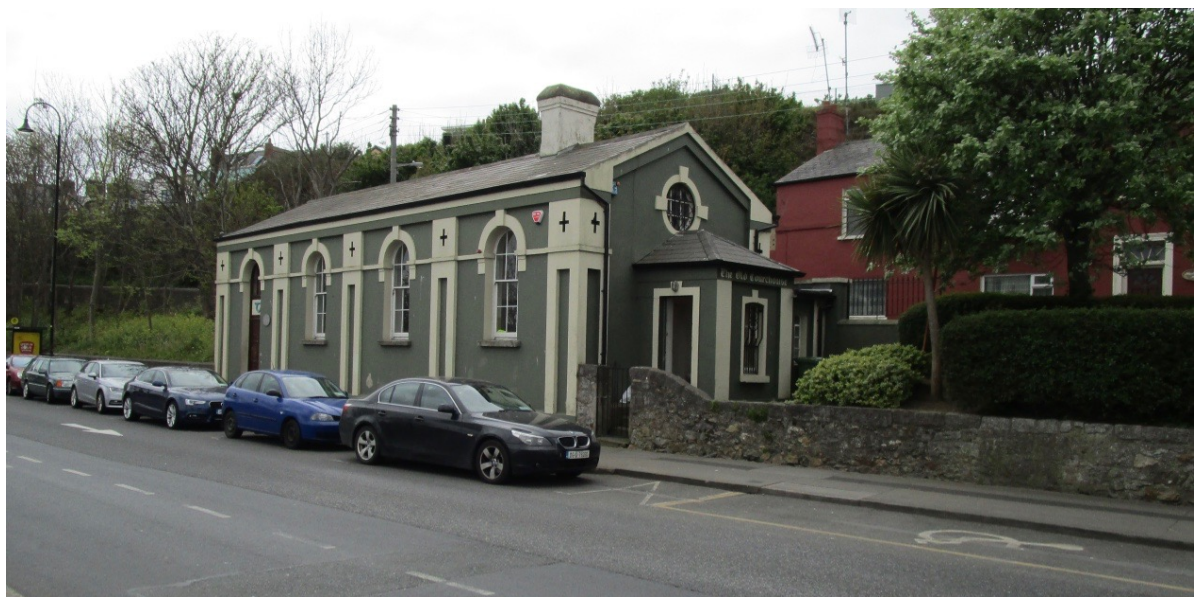
Plate 1. Exterior view of Northern side of building.