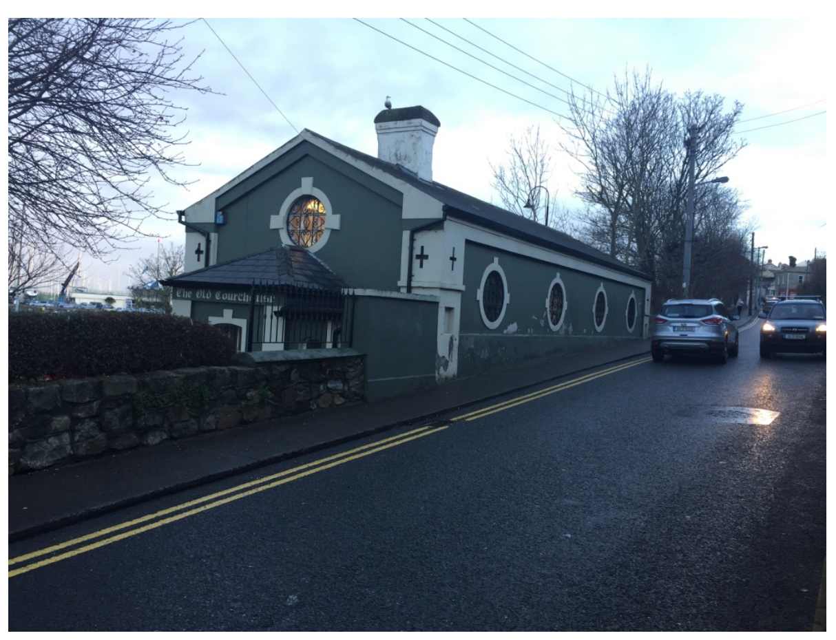
Plate 2. Exterior view of Southern side of building. The circular windows at either end of the elevation are currently blocked up and it is proposed that these windows are opened up to provide natural light to the interior of the building. All existing windows within these opes will be repaired and re-decorated.