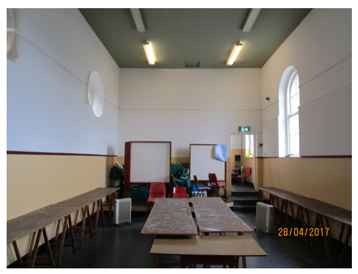
Plate 9. Interior of main hall looking West. It is proposed to remove the existing peg board from the walls and return the walls to a simple plain plaster finish. New pendant lighting is also proposed within the space. The current raised stage at the end of the hall will also be removed as part of the works. This stage does not appear to be original and was probably used when the building was used as a courthouse.