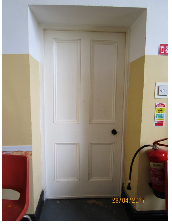
Plate 10.Typical four panel door within the building. It is proposed to retain these doors and make any necessary repairs .

43 Sycamore Avenue Castleknock Dublin 15 Tel. +353 1 8215935 Email:ray@raymcginley.ie www.raymcginley.ie