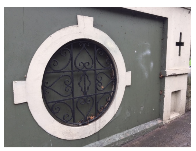
Plate 13. Circular window seen from exterior. This is one of two windows located at either end of the Southern elevation which is currently blocked up. It is proposed in these works to unblock the opening and reinstate a window to match the two central circular windows in detail.