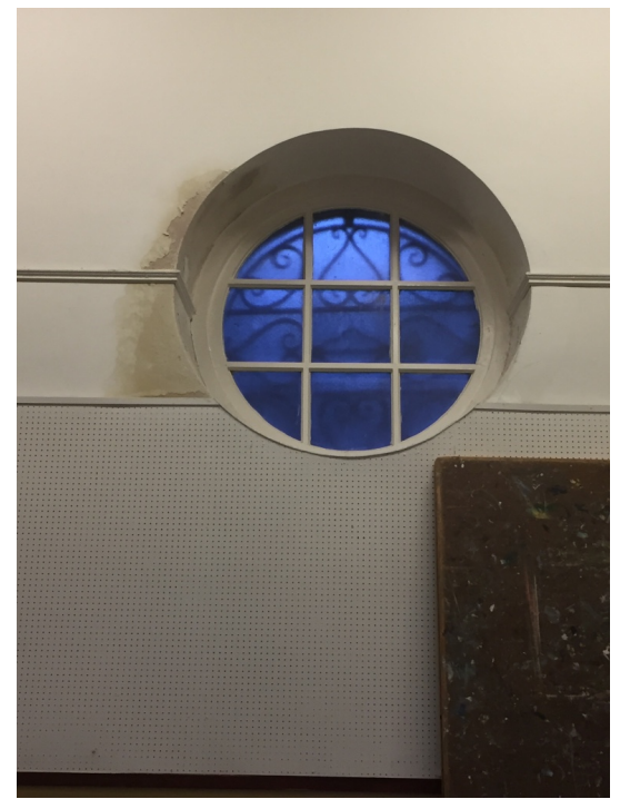
Plate 12.Circular window at high level in main hall. These windows will be repaired where necessary by a specialist sub-contractor and re-decorated.