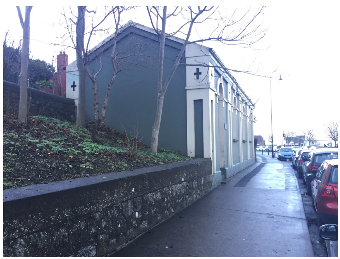
Plate 3. Exterior view of building from East.