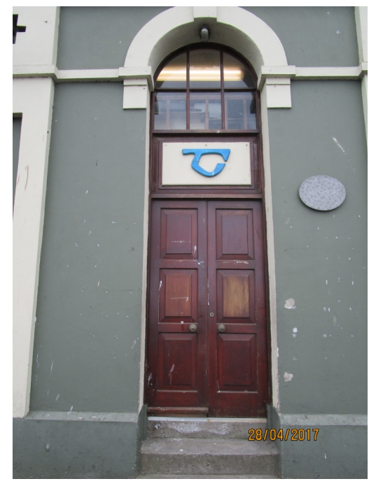
Plate 6. Door on North elevation.

43 Sycamore Avenue Castleknock Dublin 15 Tel. +353 1 8215935 Email:ray@raymcginley.ie www.raymcginley.ie