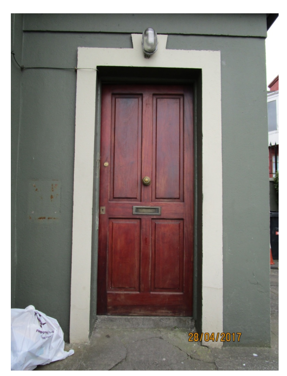
Plate 5. Entrance door on Porch.