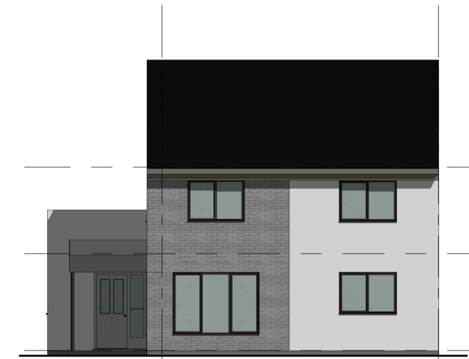
3 HT D - Front Elevation 1 : 100