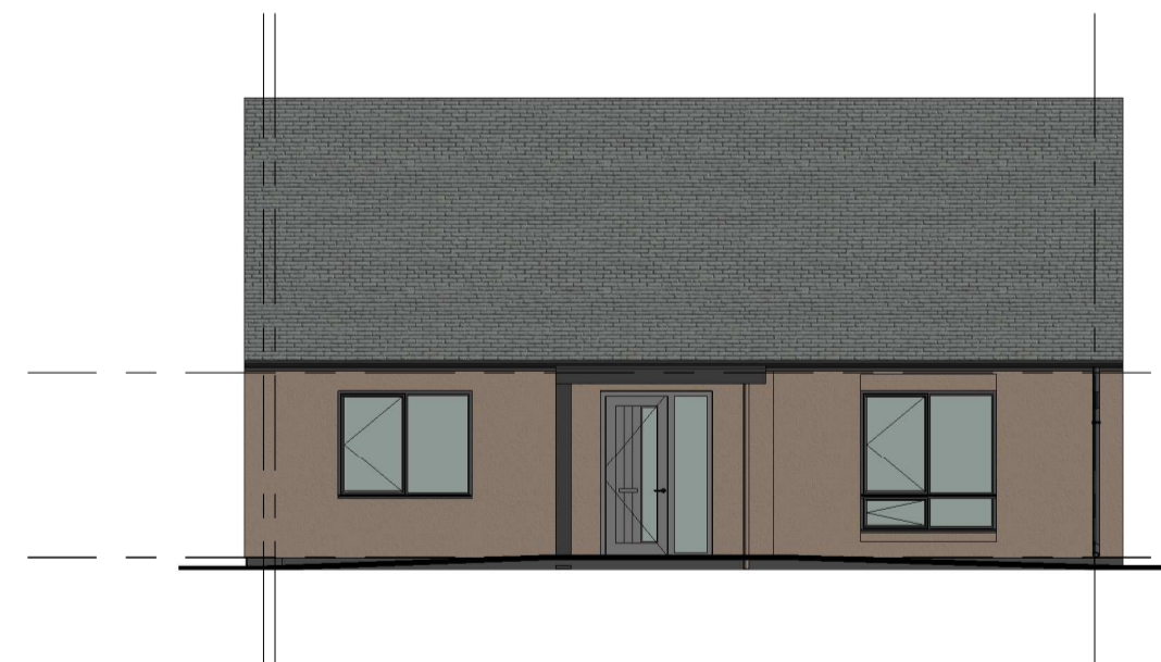
6 HT A - Front Elevation 1 : 100