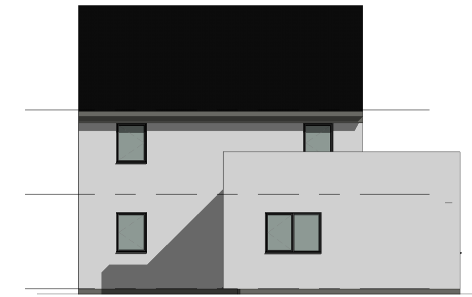
4 HT D - Rear Elevation 1 : 100