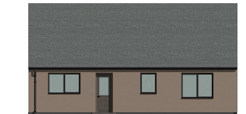
7 HT A - Rear Elevation 1 : 100

Comhairle Contae Fine Gall Fingal County Council Architects Department County Hall, Main Street, Swords, Co Dublin. County Architect: Fionnuala May Dip-Arch B.Arch.Sc. MUSEC MRBA Tel: 01 890 5050 architects@fingal.ie Client