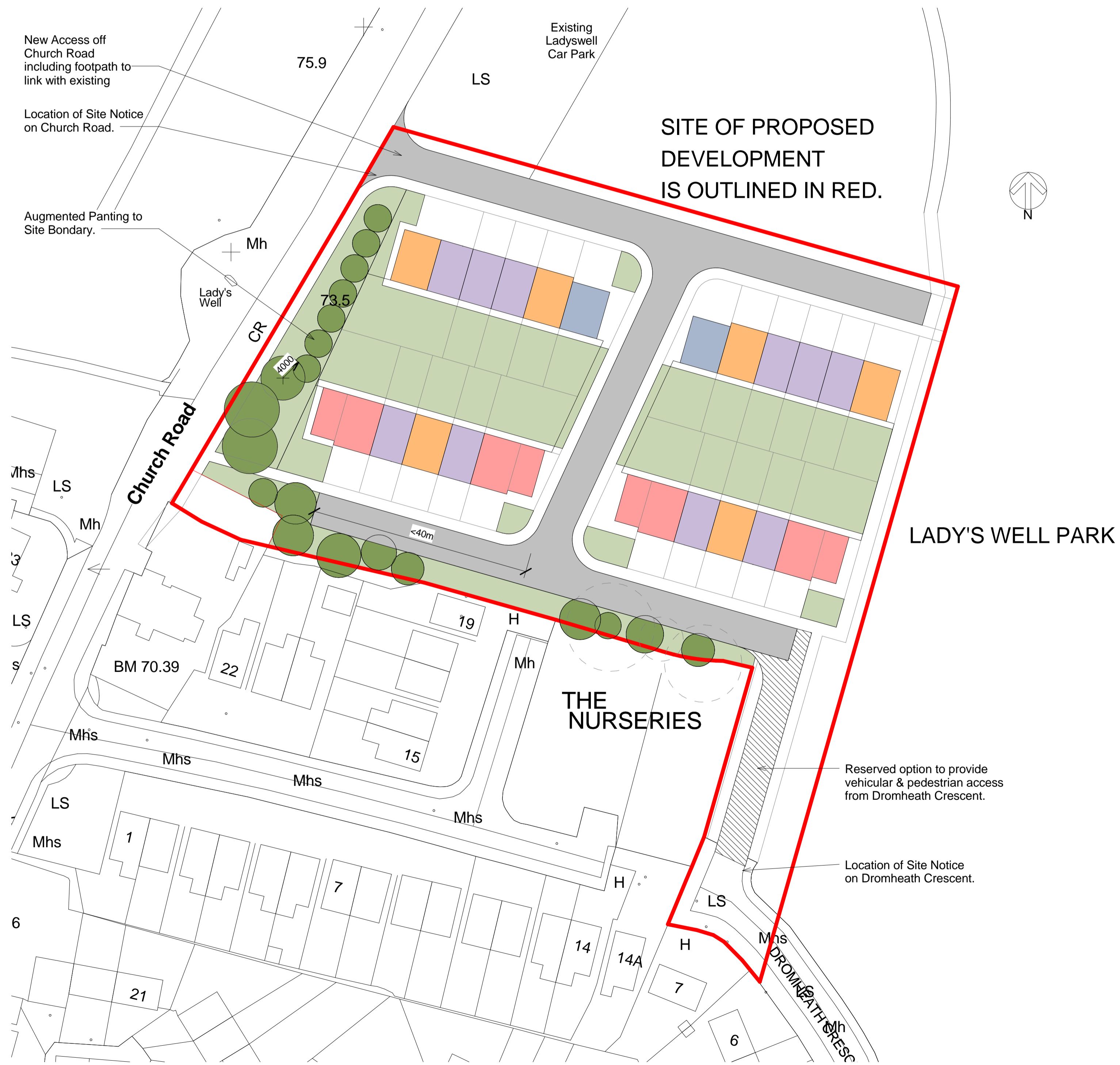
2 Site Layout Plan 1 : 500

The site is located adjacent to Lady's Well Park and pedestrian access will be provided to the Park in Consultation with Fingal County Council, Parks Planning and Strategic Infrastructure Section.