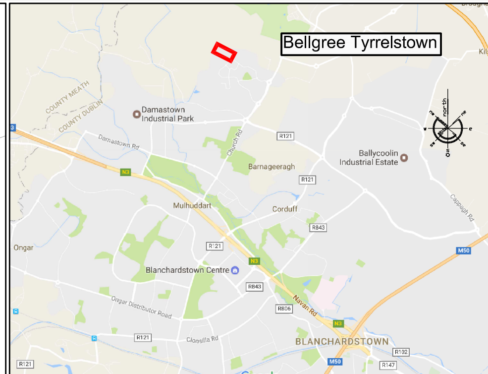
Site Location Map Not to Scale