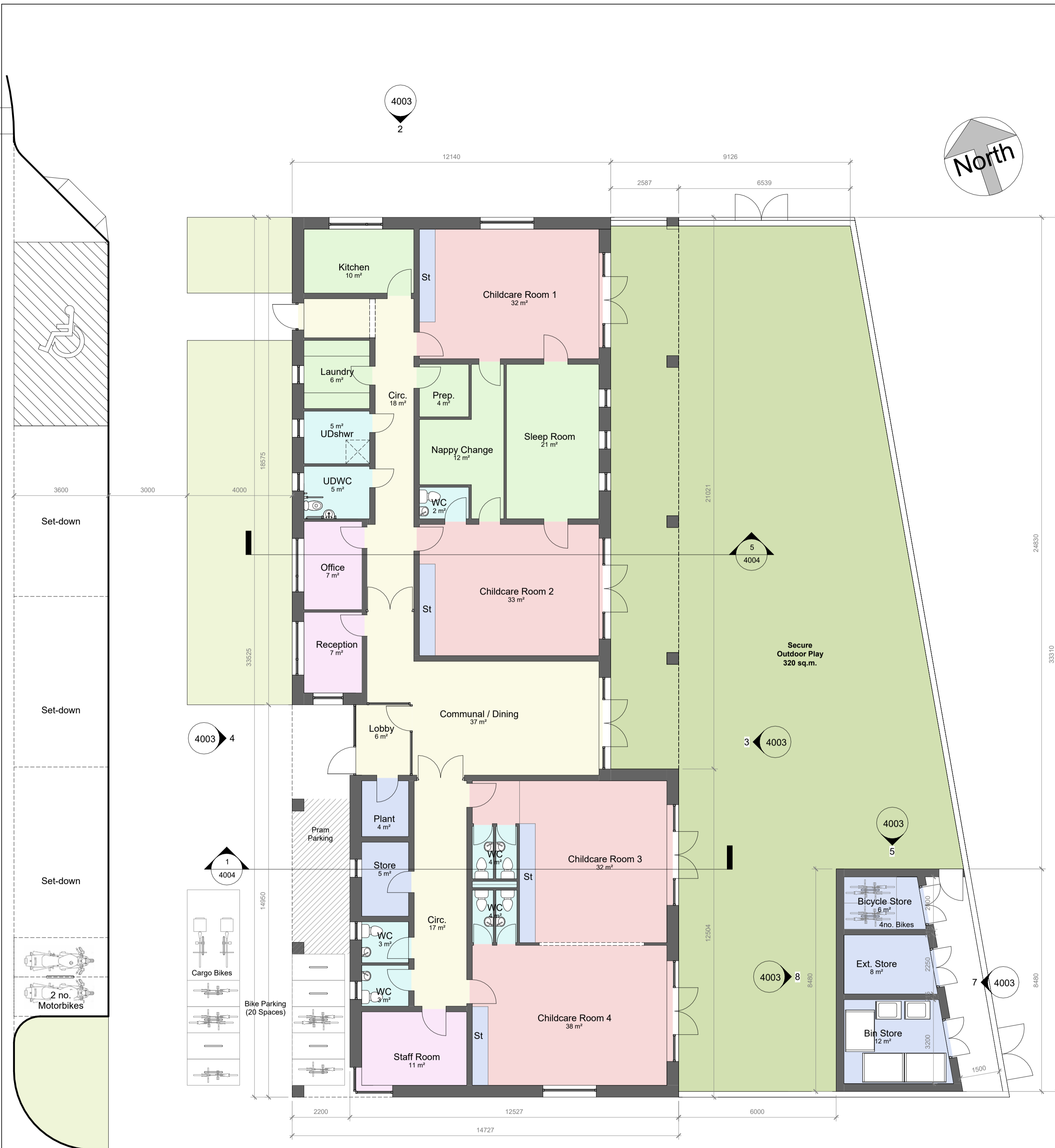
1 Ground Floor Plan 1 : 100

General Notes: 1. USE FIGURED DIMENSIONS ONLY - DO NOT SCALE. 2. ALL DRAWINGS TO BE READ IN CONJUNCTION WITH CIVIL, STRUCTURAL, MECHANICAL & ELECTRICAL, FIRE CONSULTANT ENGINEERS DRAWINGS & SPECIFICATIONS, AS WELL AS DAC DOCUMENTATION. 3. ANY DISCREPANCIES TO BE BROUGHT TO ARCHITECTS ATTENTION. 4. INFORMATION EXTRACTED FROM BIM MODELS I.E. PRINTED FORMAT TO TAKE PRECEDENCE OVER BIM MODEL.