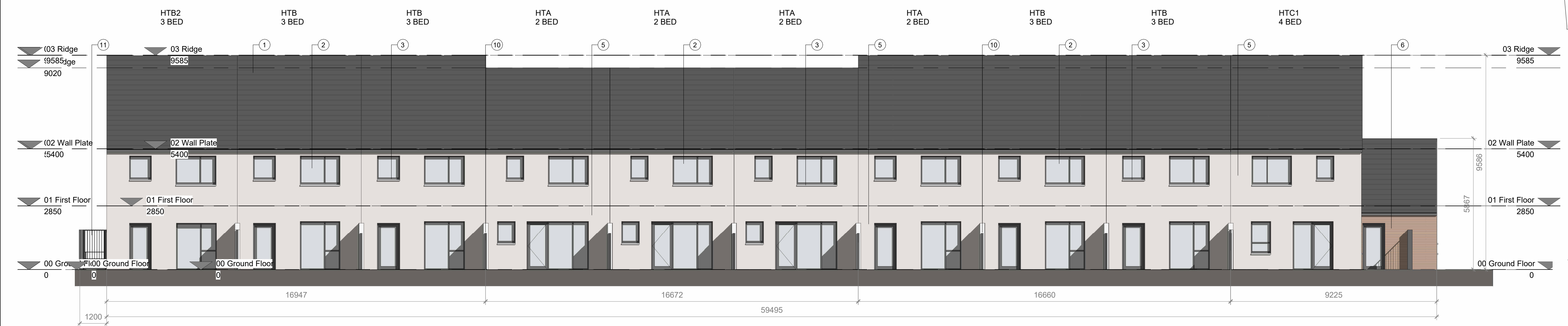
Block Type F - Typical Rear Elevation 1 : 100