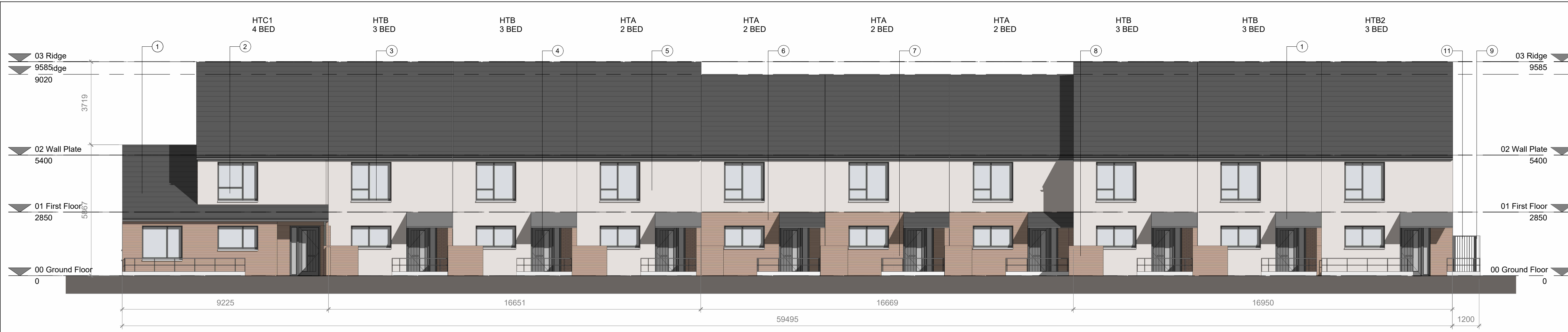
Block Type F - Typical Front Elevation 1 : 100