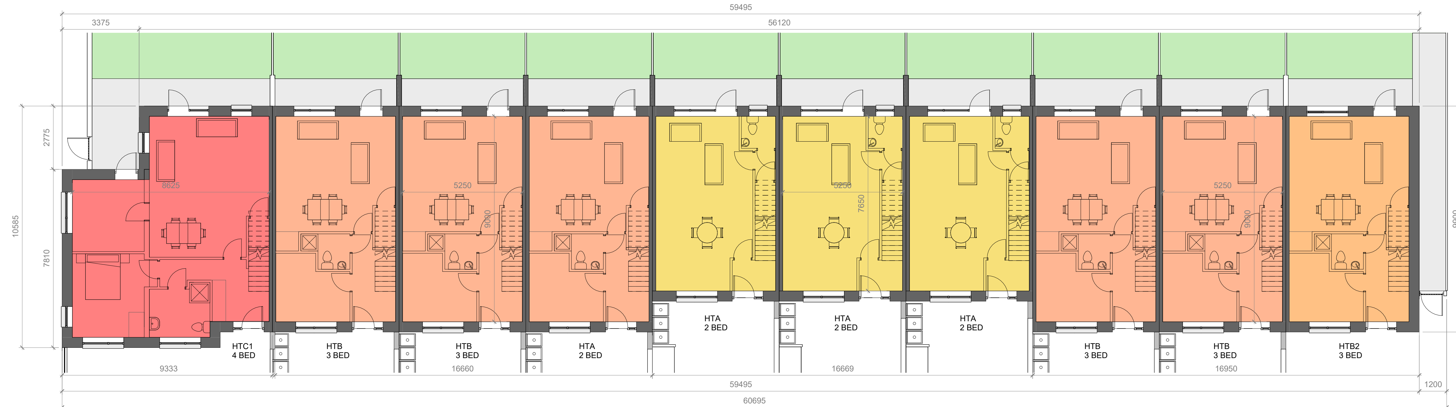
Block Type F - Typical Ground Floor Plan 1 : 100

NOTE: REFER TO HOUSE TYPE DRAWINGS & SITE DEVELOPMENT PLAN FOR DETAILS ON FRONT PRIVACY STRIP AND DRIVEWAY LAYOUTS