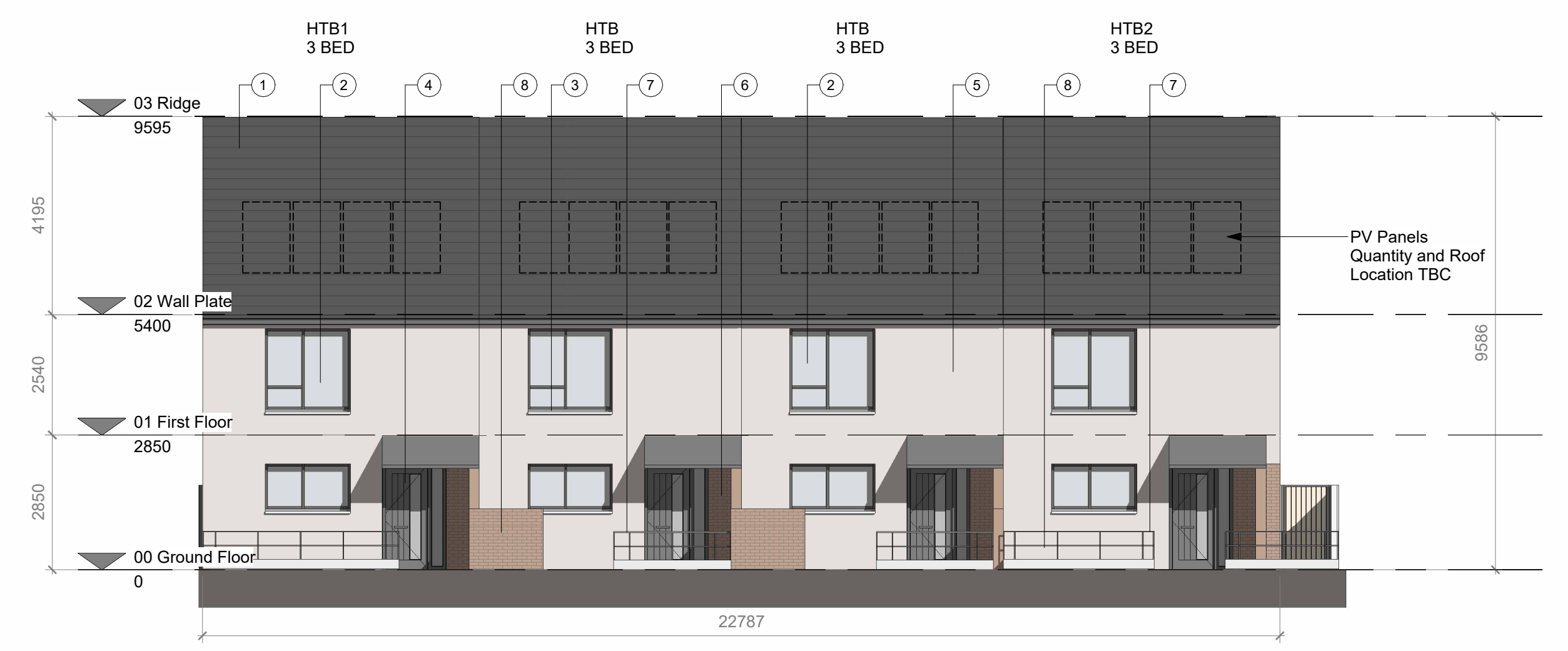
BT C Front Elevation

NOTE: Level vary between blocks. Refer to Sie Plan for specific levels.