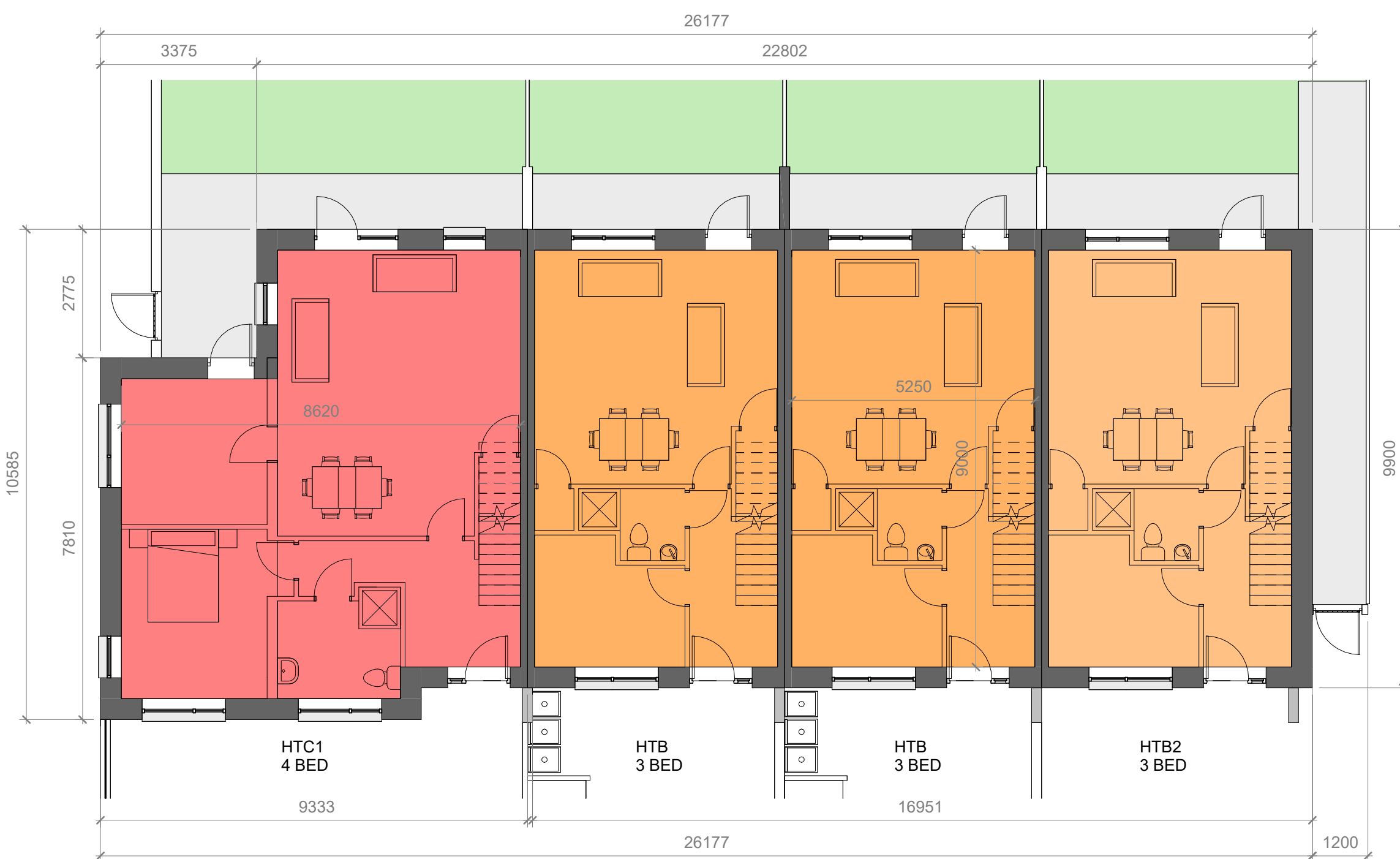
Block Type B - Typical Ground Floor Plan 1 : 100