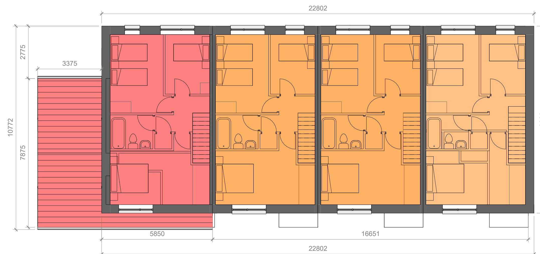
Block Type B - Typical First Floor Plan 1 : 100