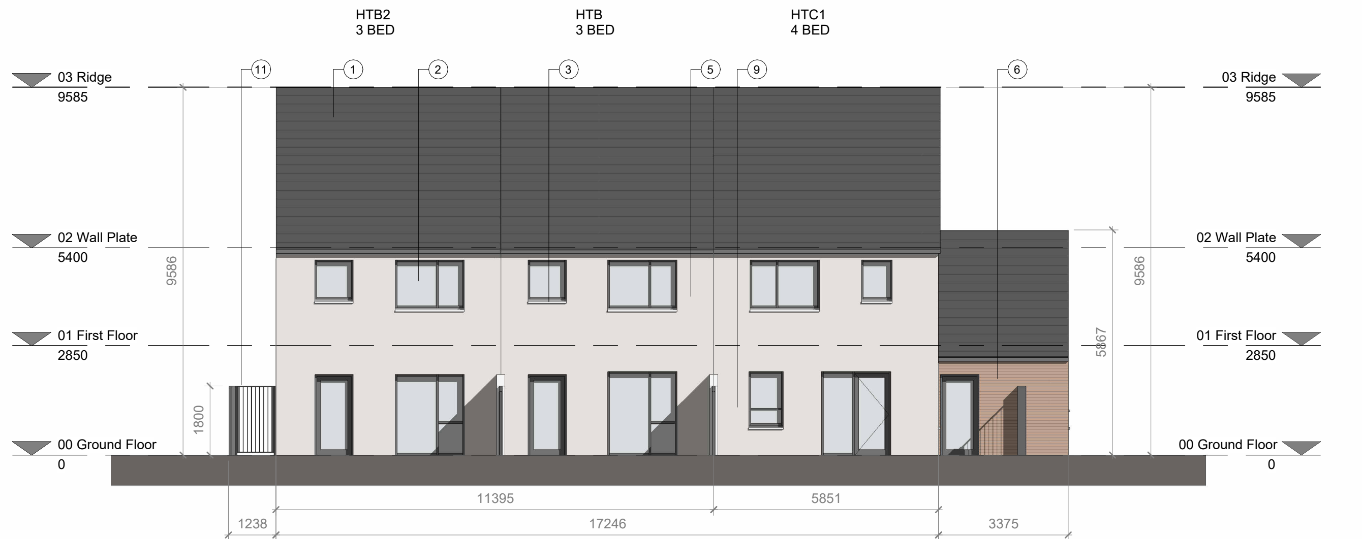
Block Type A - Typical Rear Elevation