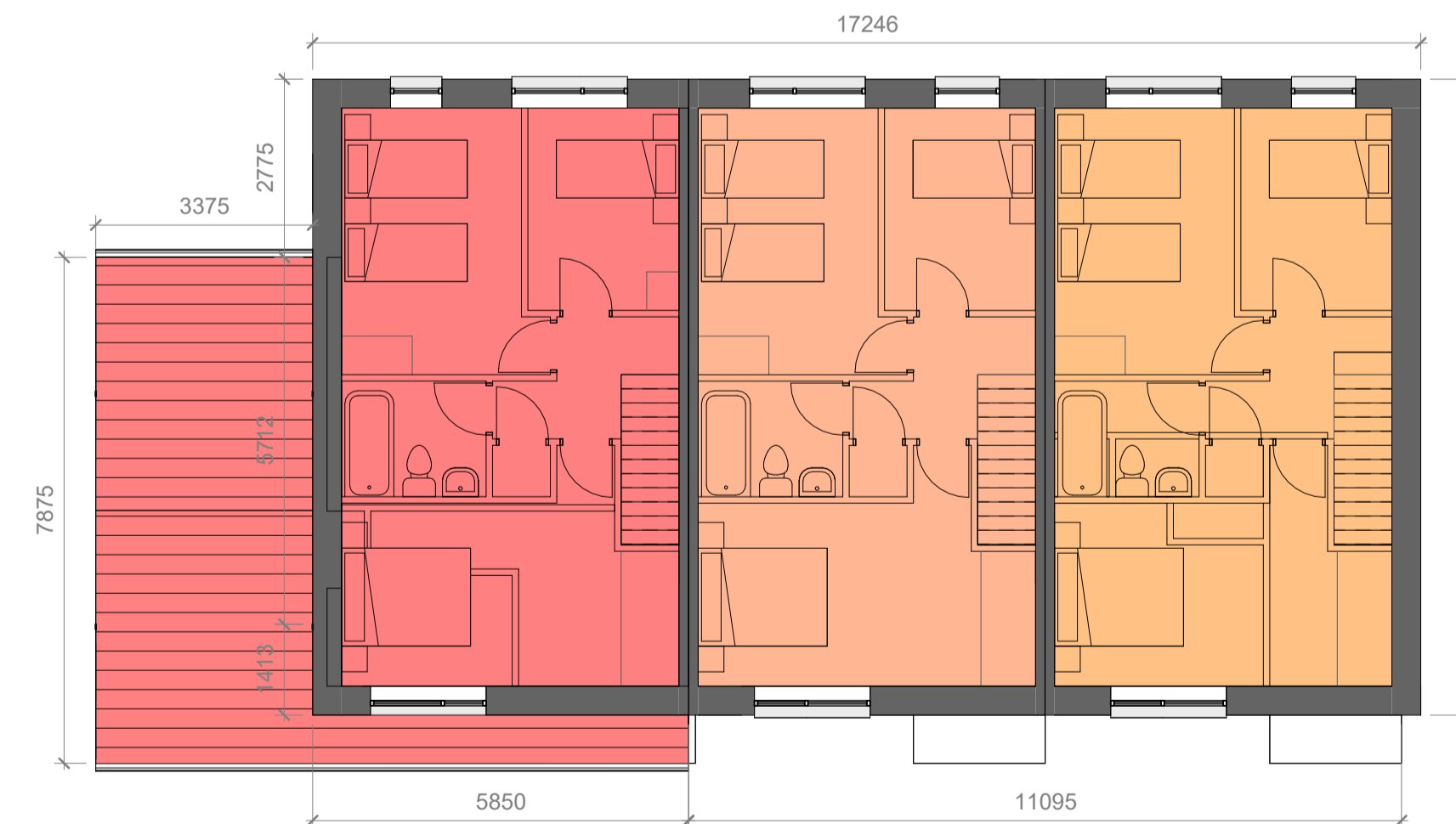
Block Type A - Typical First Floor Plan 1 : 100

Comhairle Contae Fine Gall Fingal County Council Architects Department County Hall, Main Street, Swords, Co Dublin. County Architect: Fionnuala May Dip Arch B Arch.Sc. MUBC MRIAI Tel: 01 890 5050 architects@fingal.ie Client