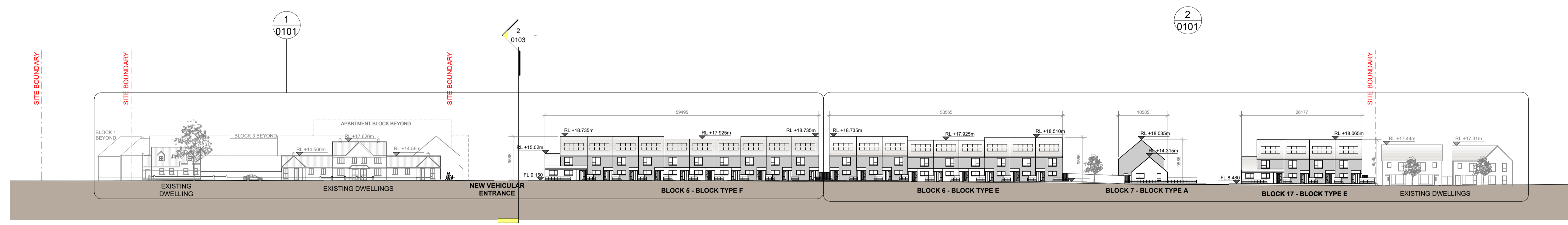
3 New Road Site Elevation 1 : 500

Comhairle Contae Fine Gall Fingal County Council Architects Department County Hall, Main Street, Swords, Co Dublin. County Architect: Fionnuala May Dip Arch B.Arch.Sc. MUBC MRAI Tel: 01 890 5050 architects@fingal.ie