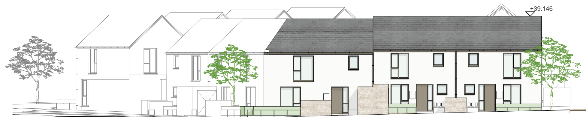
E-21 P3406 ELEVATION NORTH BLOCK 4D 1:200