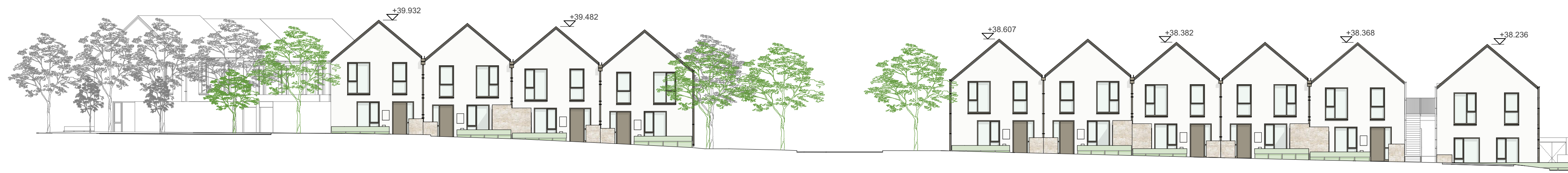
E-20 P3406 ELEVATION SOUTHEAST BLOCKS 4D AND 4F 1:200

Tiles: Blue/Black Slate or Tile Brick: Light Buff Brick with Coloured Mortar Render: Smooth Render Warm White Window & Rainwater Goods: PPC Deep Bronze Colour Doors: Coloured to complimentary colour