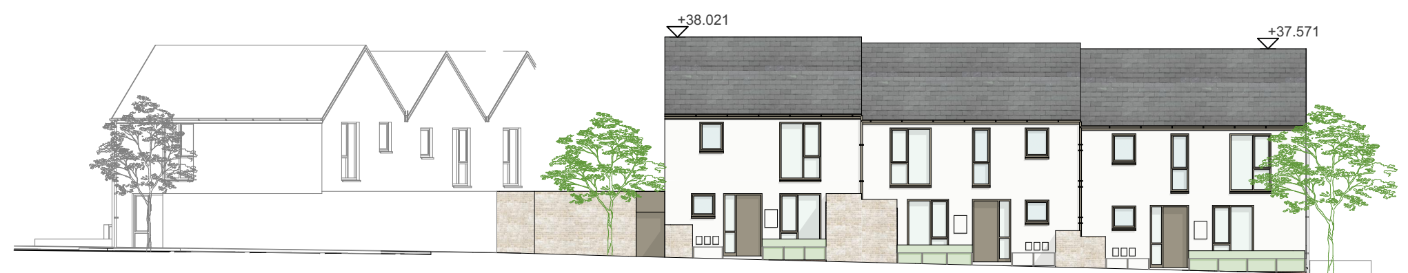
E-23 P3406 ELEVATION SOUTHEAST BLOCK 4E 1:200