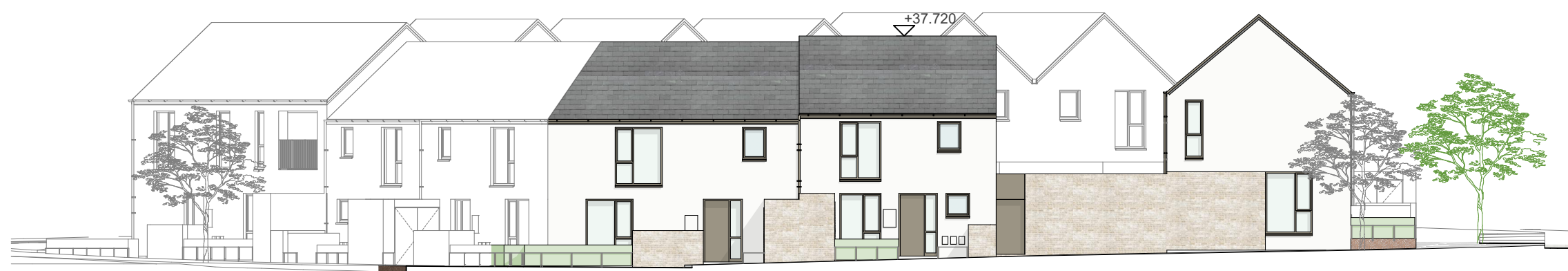
E-22 P3406 ELEVATION NORTH BLOCK 4F 1:200