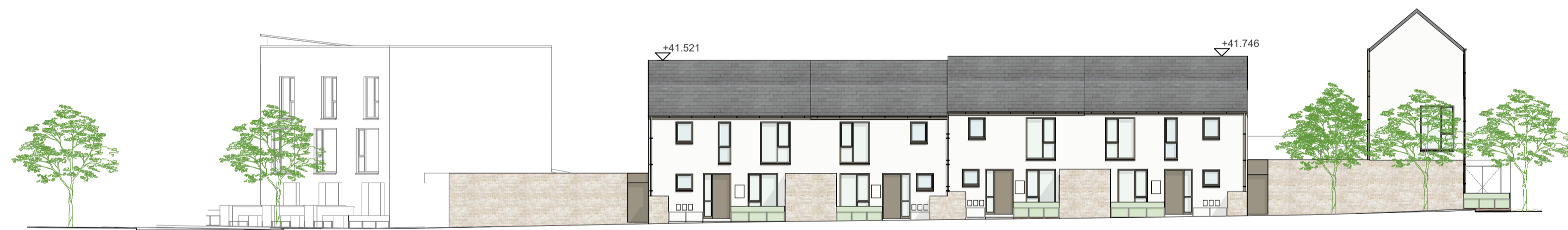
E-14 P3404 ELEVATION NORTH BLOCK 4B 1:200