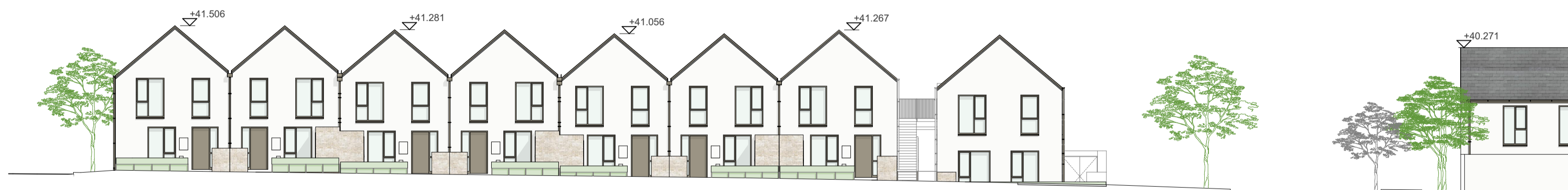
E-15 P3404 ELEVATION SOUTH BLOCK 4C 1:200