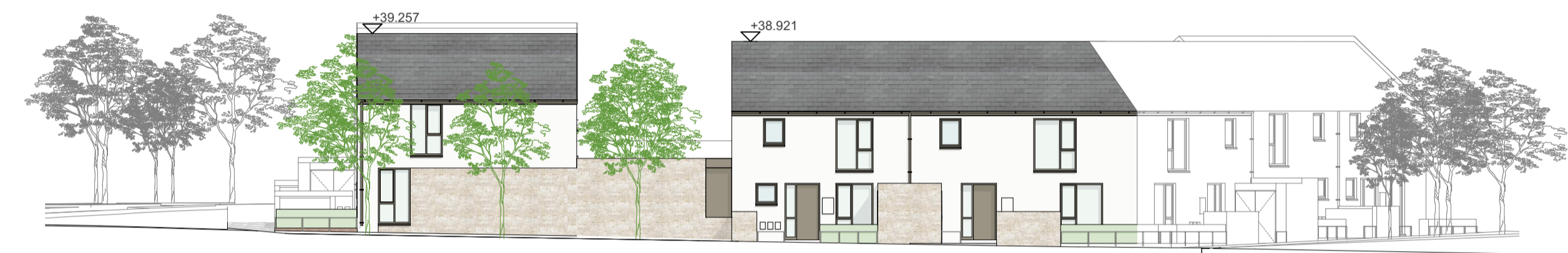
E-13 P3404 ELEVATION NORTHEAST BLOCK 4D 1:200