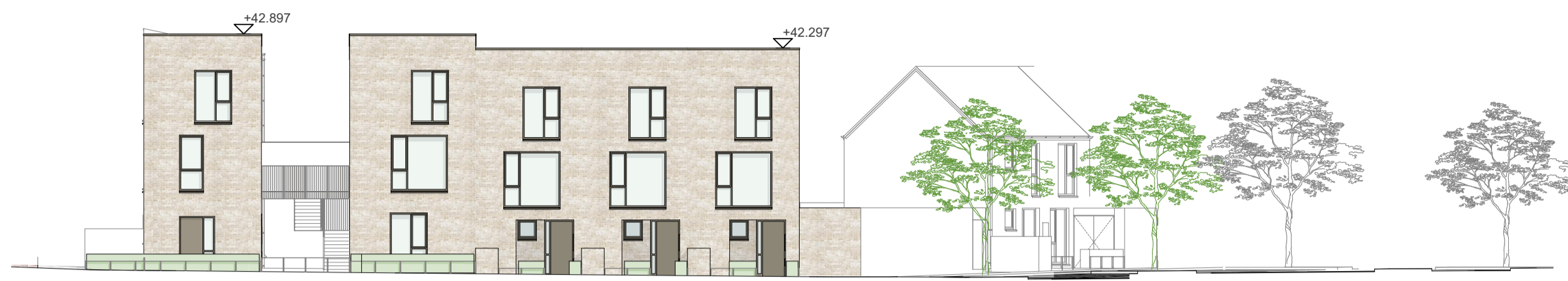
E-11 P3404 ELEVATION NORTHEAST BLOCK 4B 1:200

Tiles: Blue/Black Slate or Tile Brick: Light Buff Brick with Coloured Mortar Render: Smooth Render Warm White Window & Rainwater Goods: PPC Deep Bronze Colour Doors: Coloured to complimentary colour