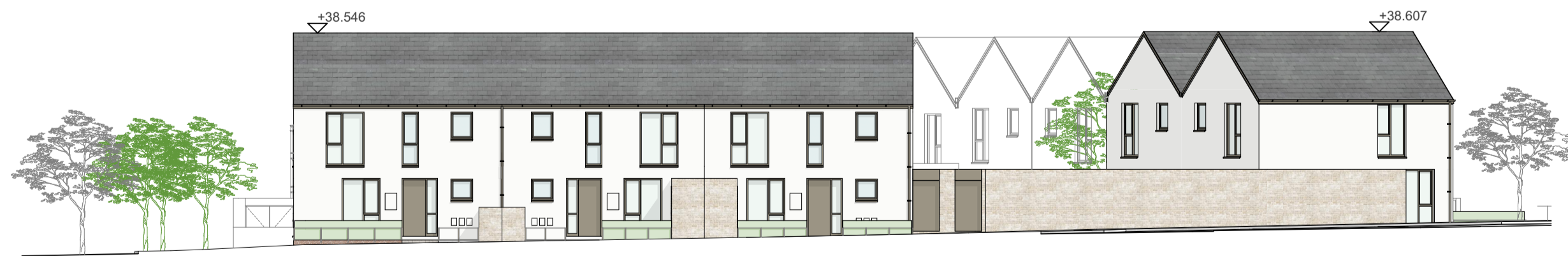
E-10 ELEVATION WEST BLOCK 4F P3403 1:200