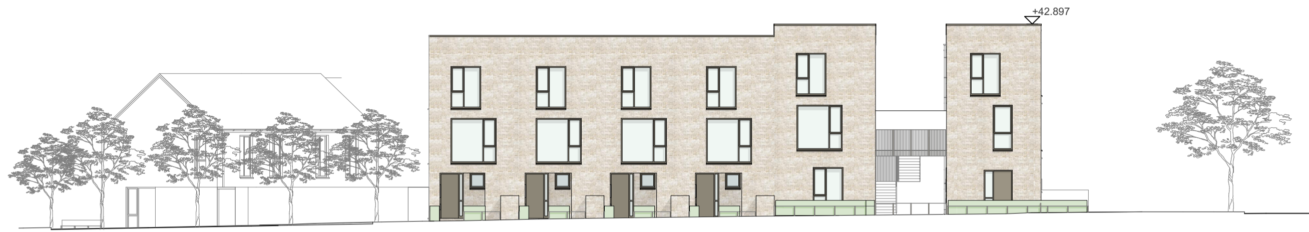
E-07 ELEVATION SOUTHWEST BLOCK 4A P3403 1:200