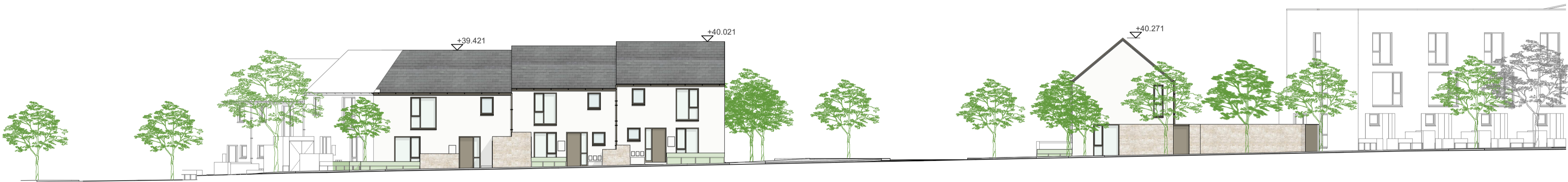
E-08 ELEVATION WEST BLOCKS 4A AND 4G P3403 1:200