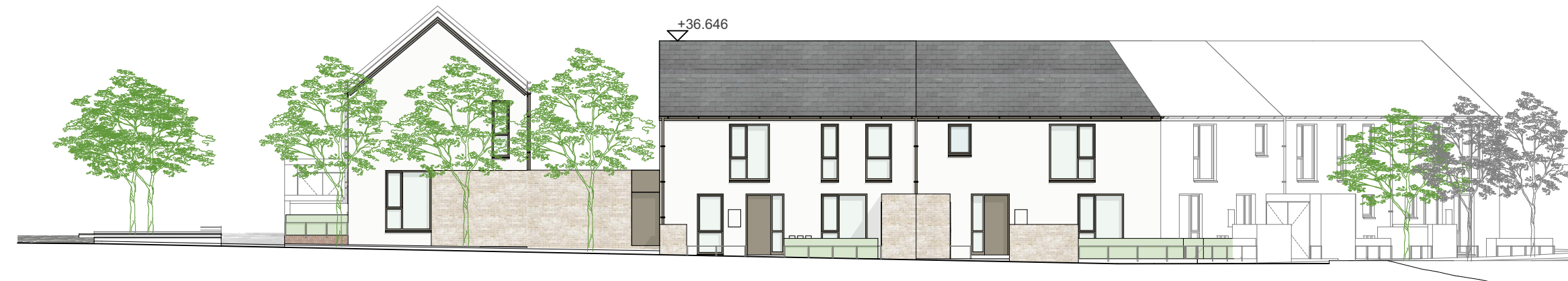
E-05 P34.02 ELEVATION NORTHEAST BLOCK 4E - TO RIPARIAN ZONE 1:200