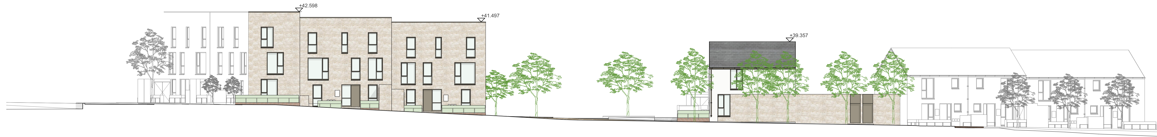
E-04 P34.02 ELEVATION EAST BLOCKS 4A AND 4G - TO RIPARIAN ZONE 1:200

Tiles: Blue/Black Slate or Tile Brick: Light Buff Brick with Coloured Mortar Render: Smooth Render Warm White Window & Rainwater Goods: PPC Deep Bronze Colour Doors: Coloured to complimentary colour