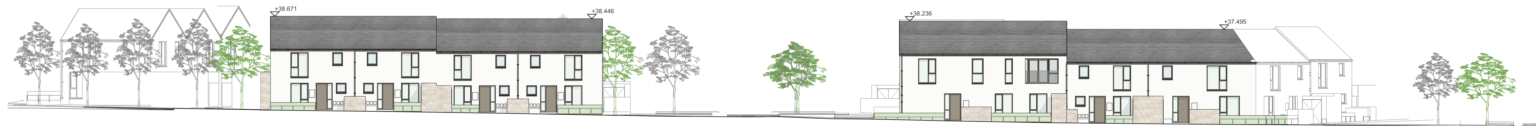
E-05 P34.02 ELEVATION NORTHEAST BLOCKS 4F AND 4G - TO RIPARIAN ZONE 1:200