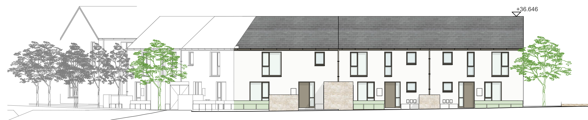
E-06 P34.02 ELEVATION SOUTH BLOCK 4E 1:200