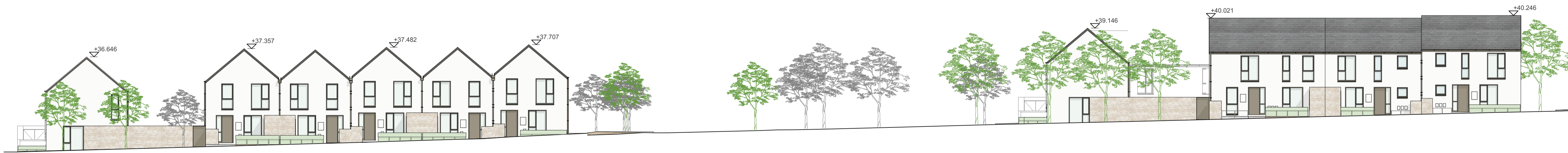
E-03 P3401 ELEVATION WEST BLOCK 4B AND 4C - TO COMMUNITY COLLEGE BOUNDARY 1:200