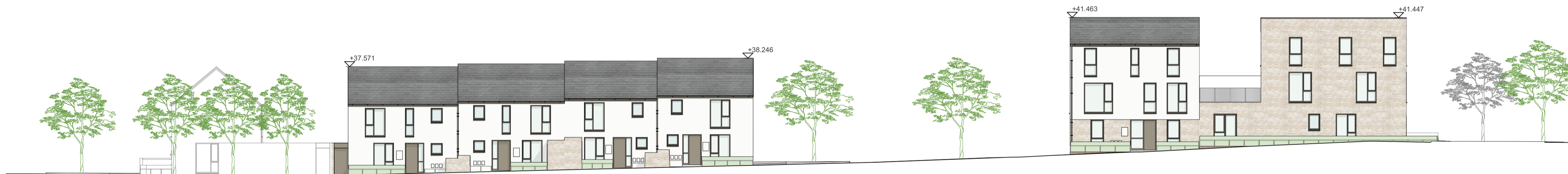
E-03 ELEVATION WEST BLOCKS 3B AND 3C - TO RIPARIAN ZONE P3301 1:200