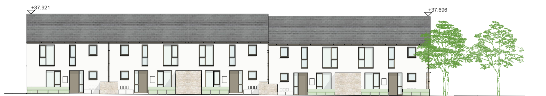
E-03 ELEVATION WEST BLOCK 3D - TO RIPARIAN ZONE P3301 1:200