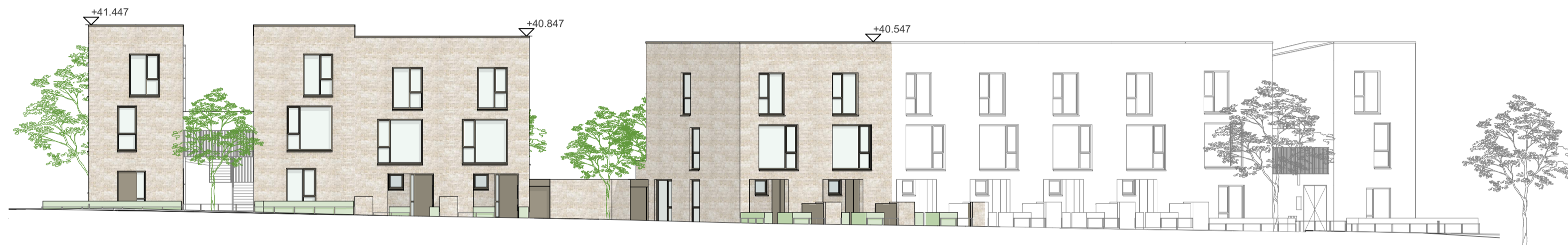
E-02 ELEVATION SOUTH BLOCK 3B - TO LINK STREET P3301 1:200