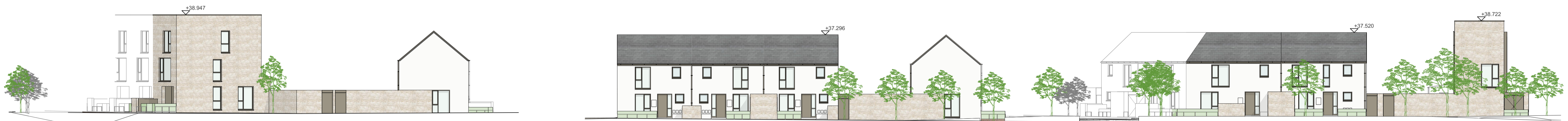
E-03 ELEVATION SOUTH BLOCK IB P3101 1:200