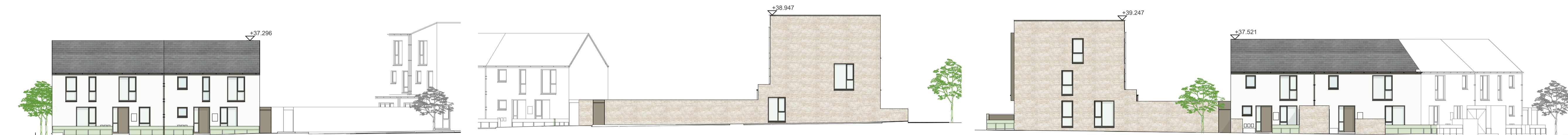
E-05 ELEVATION NORTHEAST BLOCK IB P3101 1:200