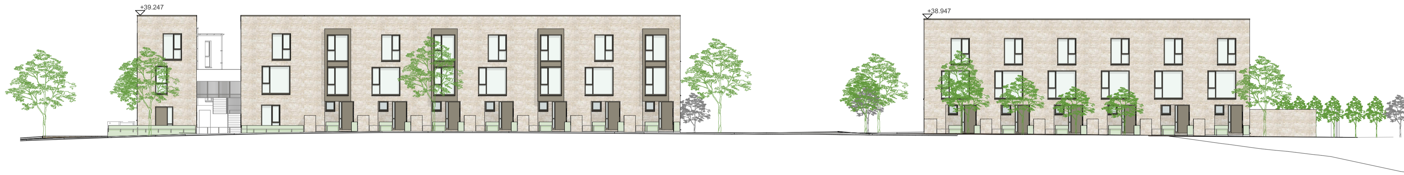
E-02 ELEVATION WEST BLOCKS IA AND IB - TO LINK STREET P3101 1:200