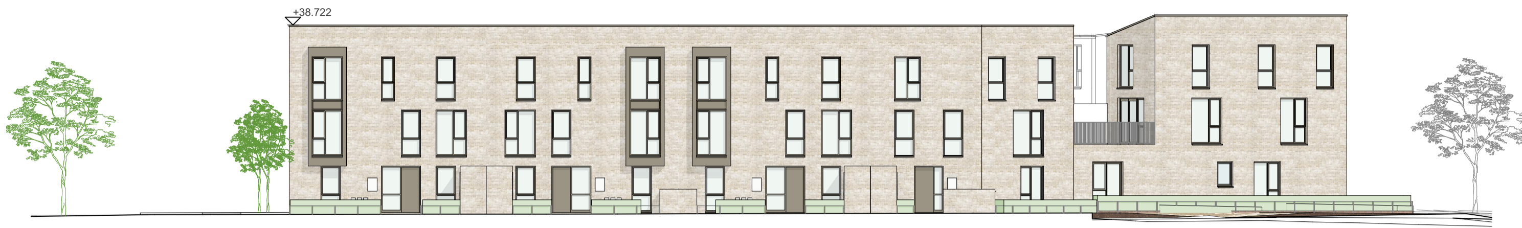
E-01 ELEVATION NORTH BLOCK IA - TO RATHBEALE ROAD P3101 1:200

Tiles: Blue/Black Slate or Tile Brick: Light Buff Brick with Coloured Mortar Render: Smooth Render Warm White Window & Rainwater Goods: PPC Deep Bronze Colour Doors: Coloured to complimentary colour