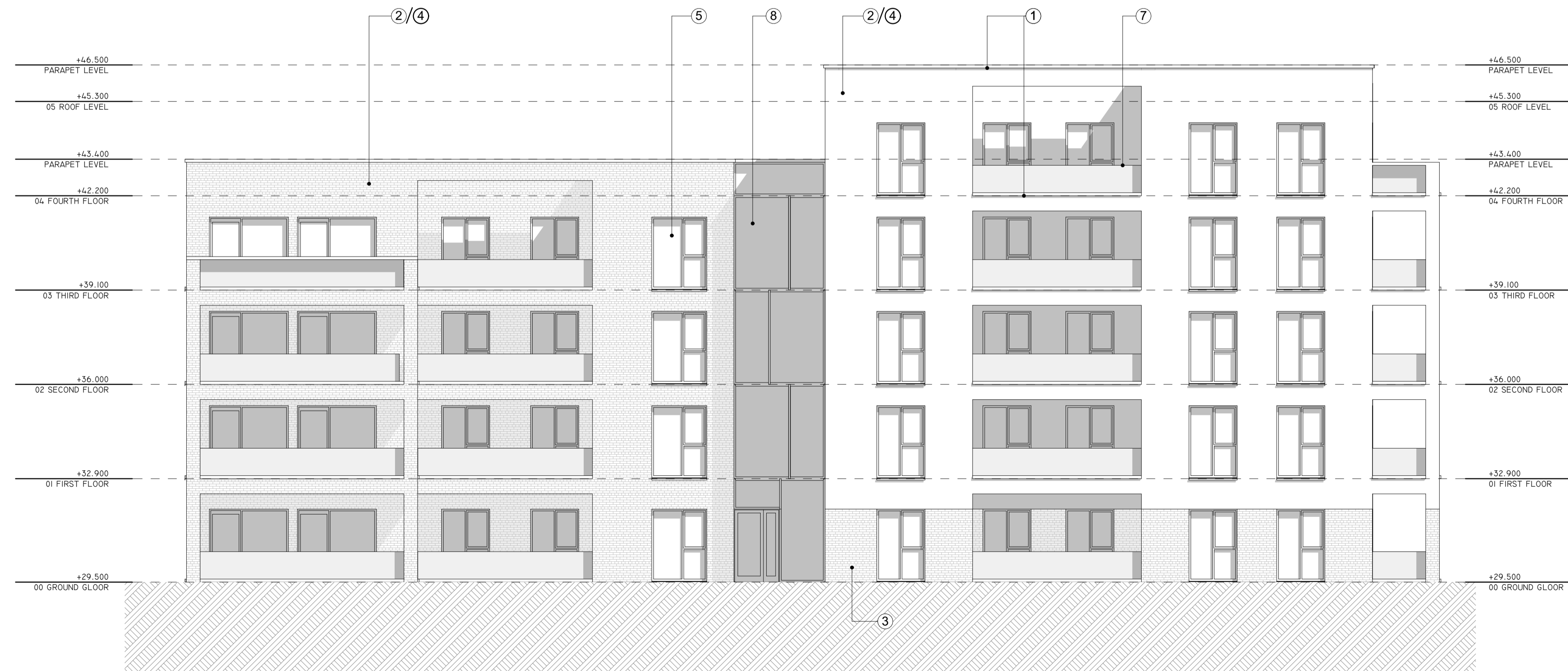
2 BLOCK 2B - WEST ELEVATION 1:100