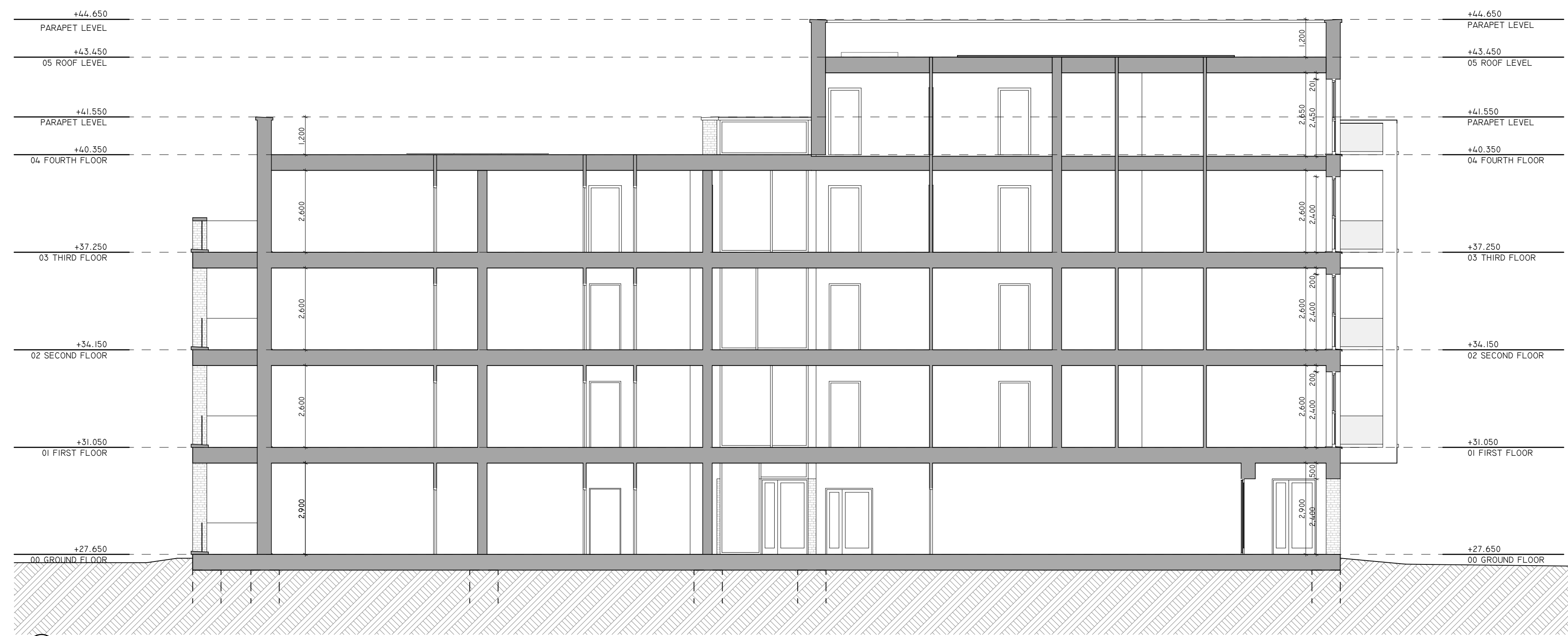
1 BLOCK 2A - SECTION A PI220 1:100