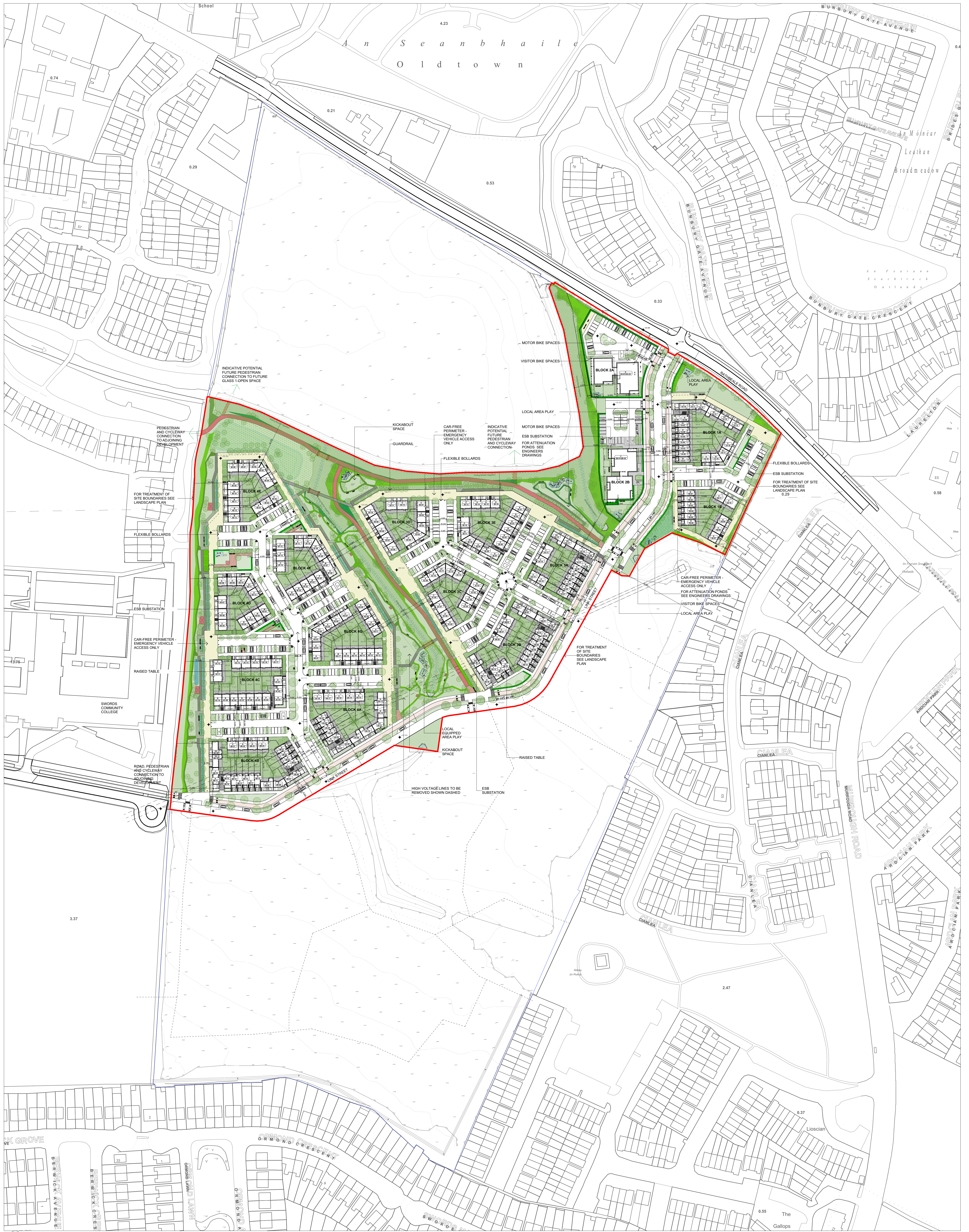
SITE LAYOUT PLAN 1:1000