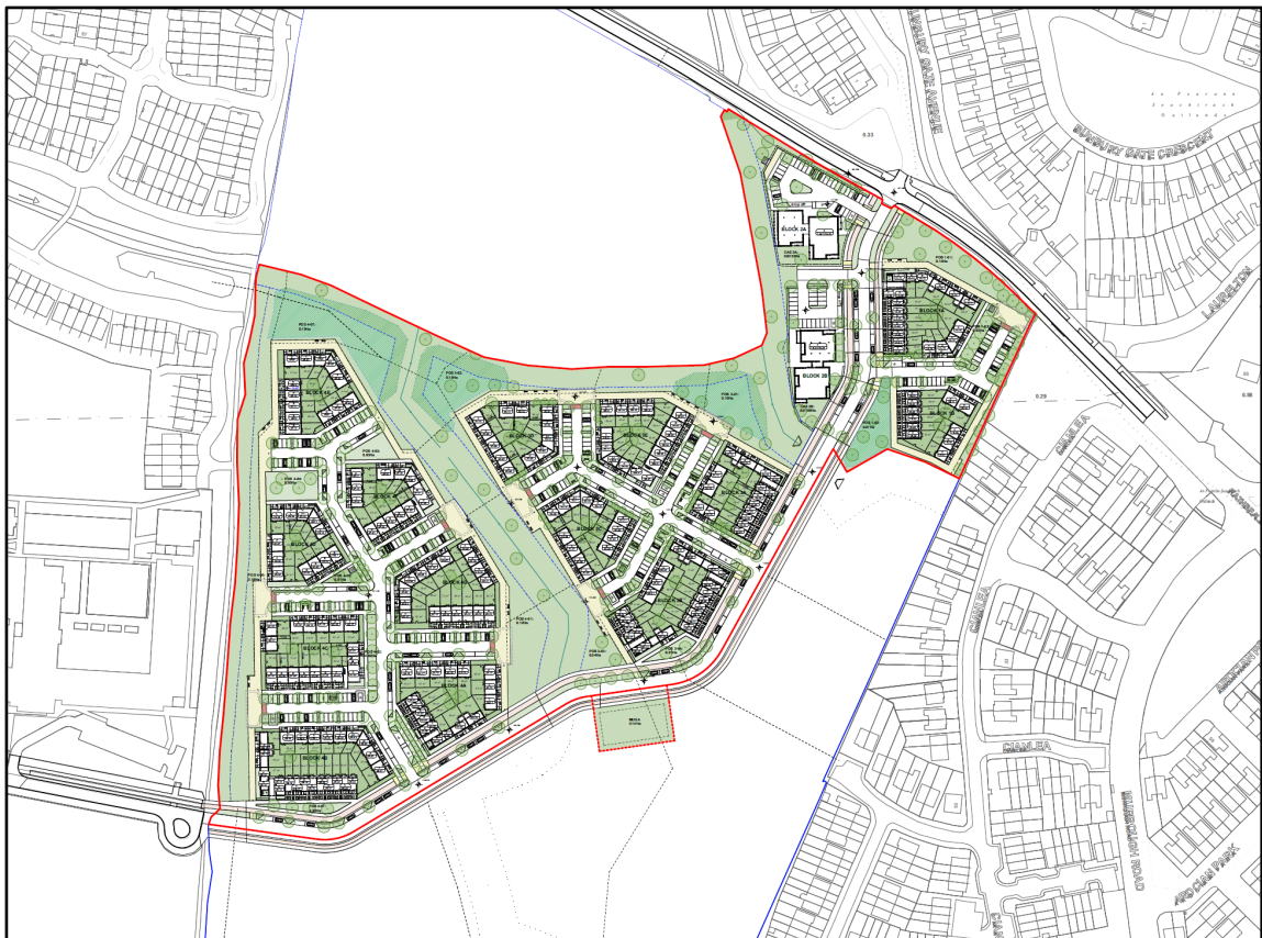
Figure 4.1 Proposed Site Layout Plan