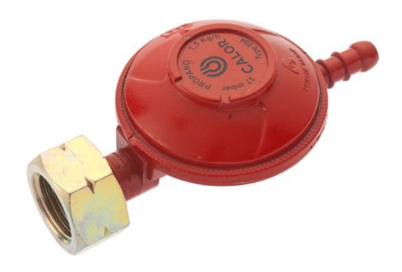
Photograph 1: Regulators