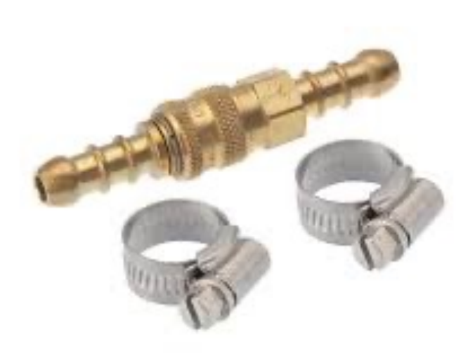
Photograph 4: Quick release gas hose coupling and jubilee clips