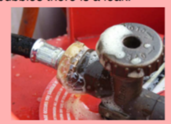
To ensure the connection is not allowing gas to escape.

To detect leaks. If the solution bubbles there is a leak.