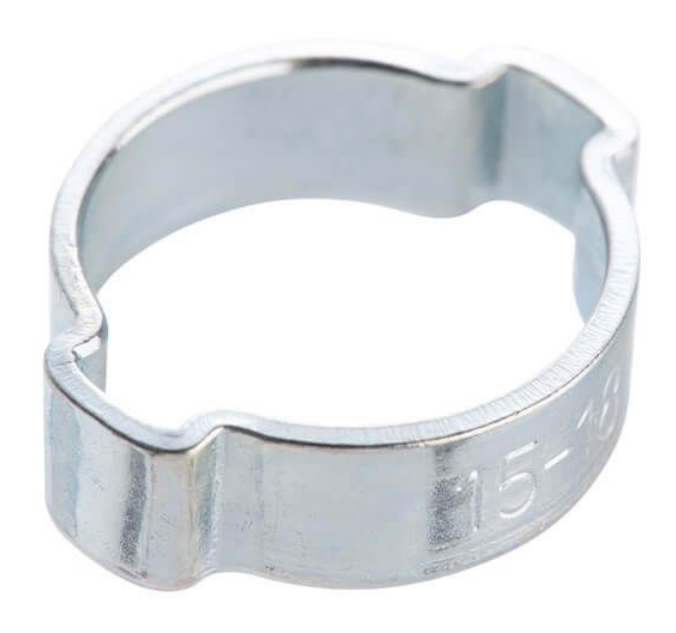
Photograph 3: Crimp Clips