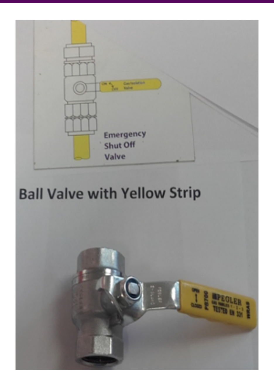
Photograph 6: Ball valves with yellow strip after regulator and before appliance (2 per run serving an appliance)