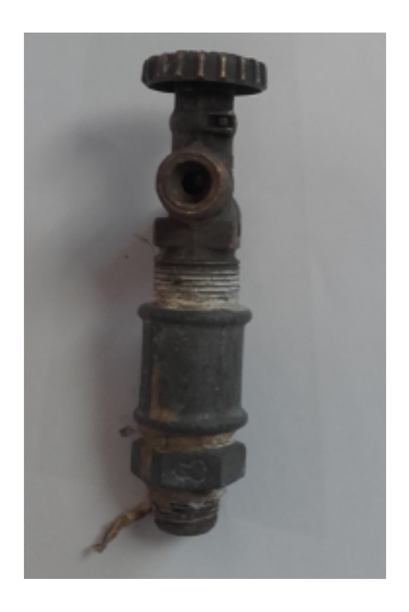
Photograph 5: Turn down valve i.e. screw on H valve.