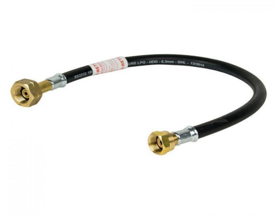
Photograph 2: Pigtail Hosing