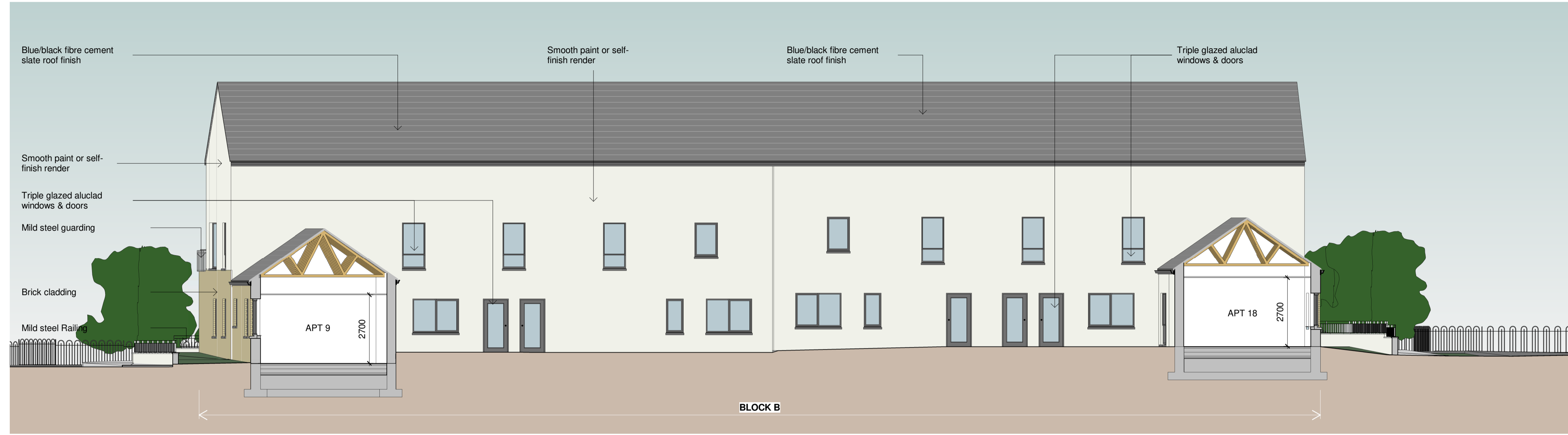
1 Site Section AA 1 : 100