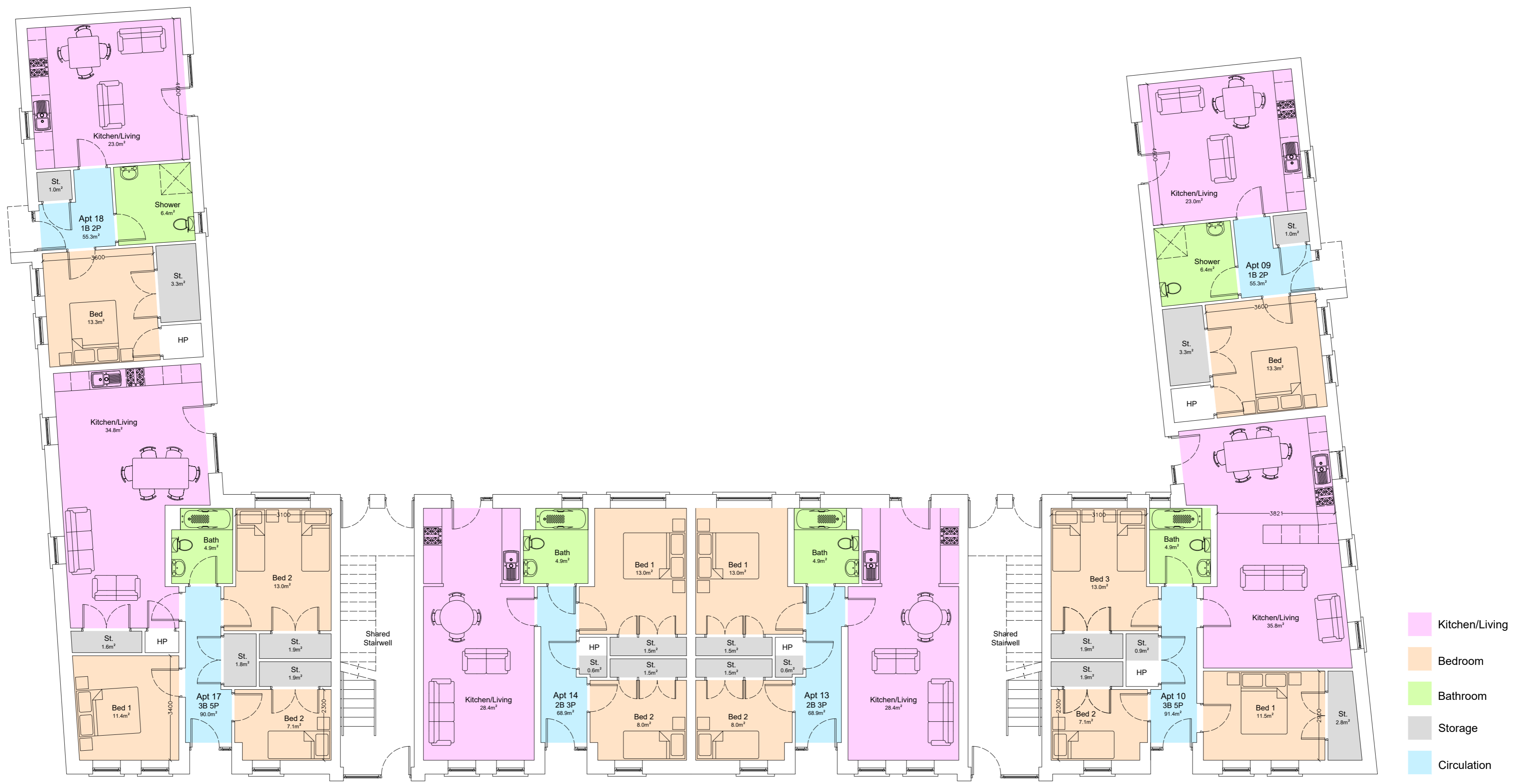
203 22-003 Block B: Ground Floor Plan 1:100BA1