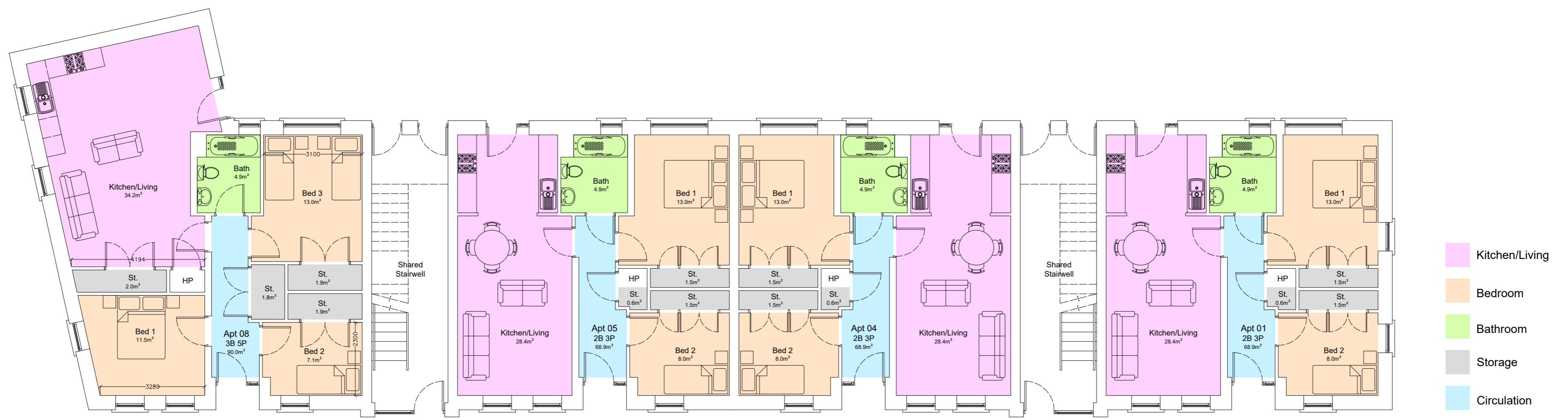
202 22-003 Block A: Ground Floor Plan 1:100@A1