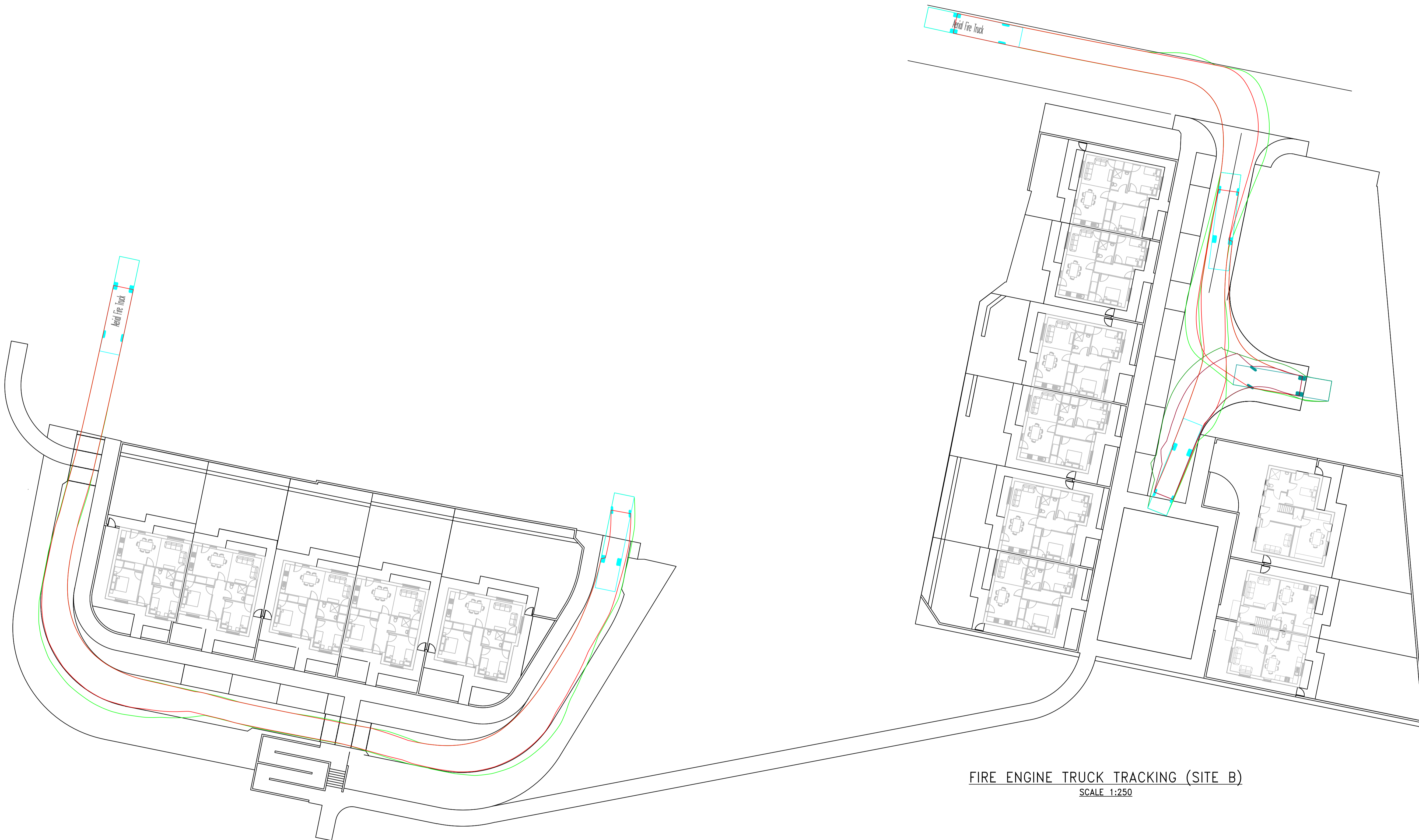
FIRE ENGINE TRUCK TRACKING (SITE A) SCALE 1:250

Aerial Fire Truck Overall Length Overall Width Overall Body Height Min Body Ground Clearance Track Width Lock to lock time Max Wheel Angle