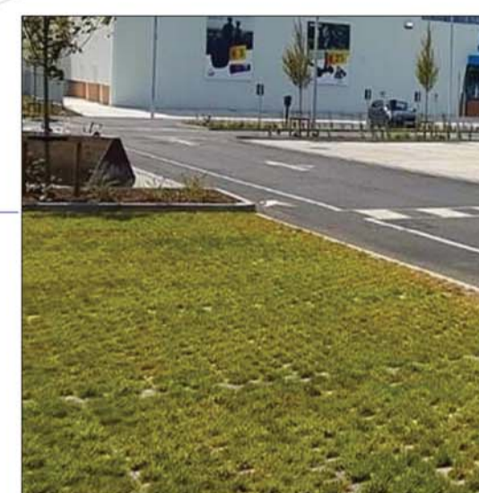
Asphalt to Carriageway