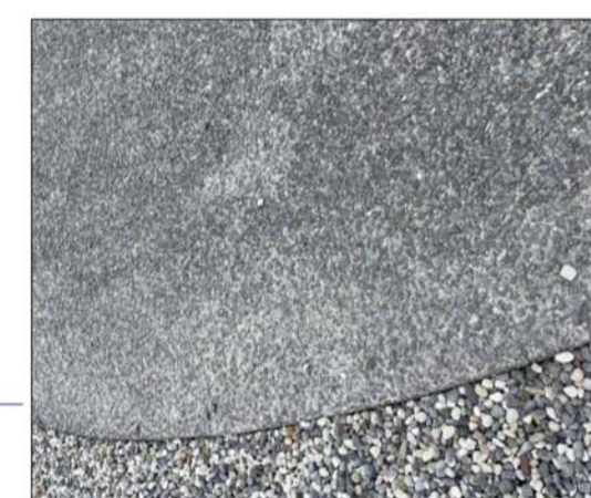
Concrete Paths Power-washed Finish