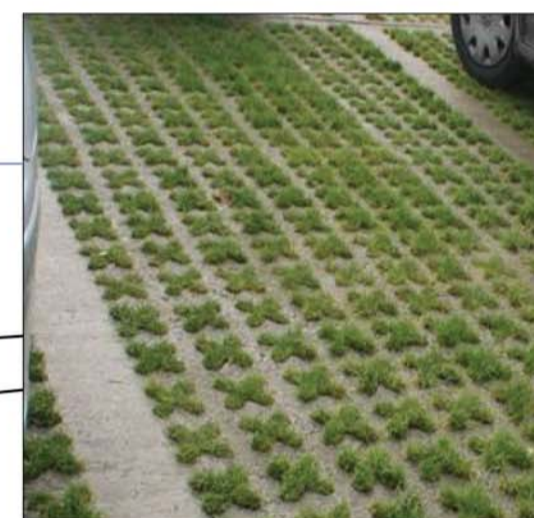
Permeable Paving to Carparking (Grasscrete)