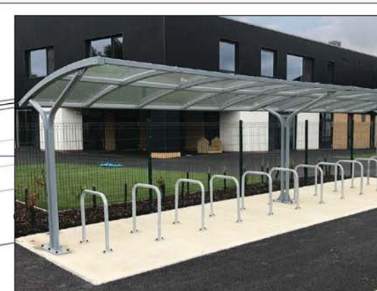
Covered Bike Racks Exact Product TBC