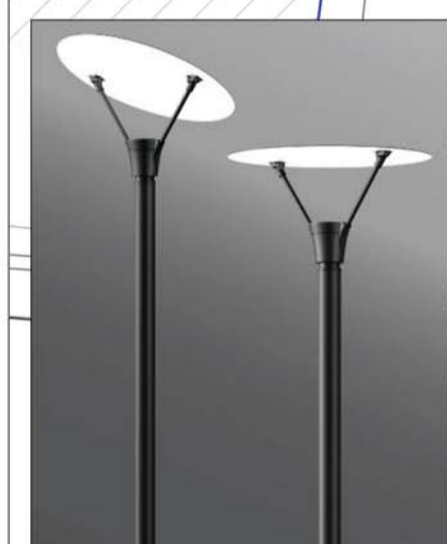
Pole Lighting Exact Product TBC