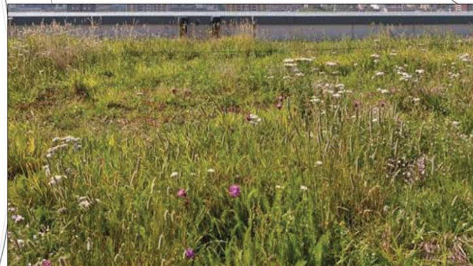
Semi-extensive green roof