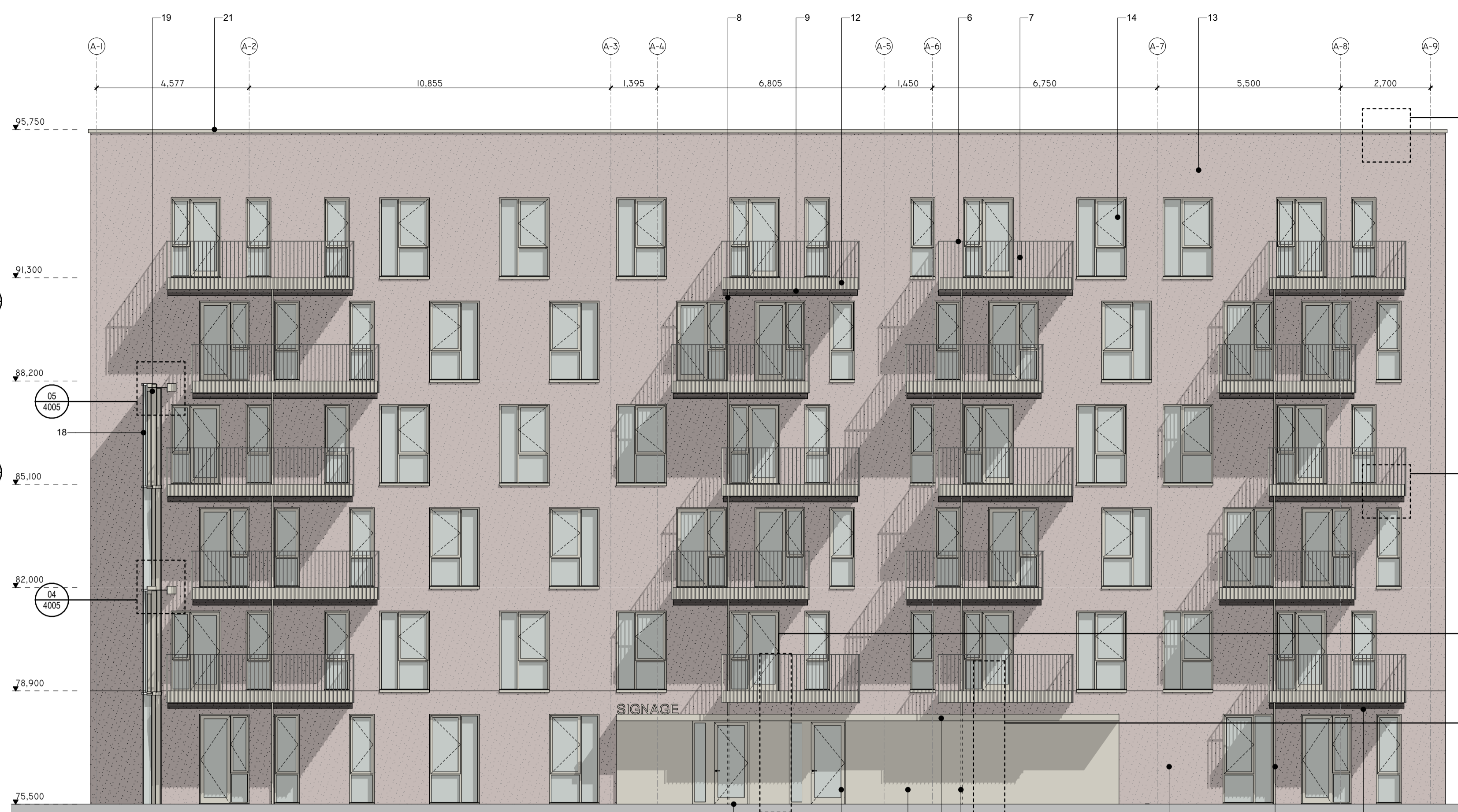
02 BLOCK A SOUTH ELEVATION I-100 P3010 1:100