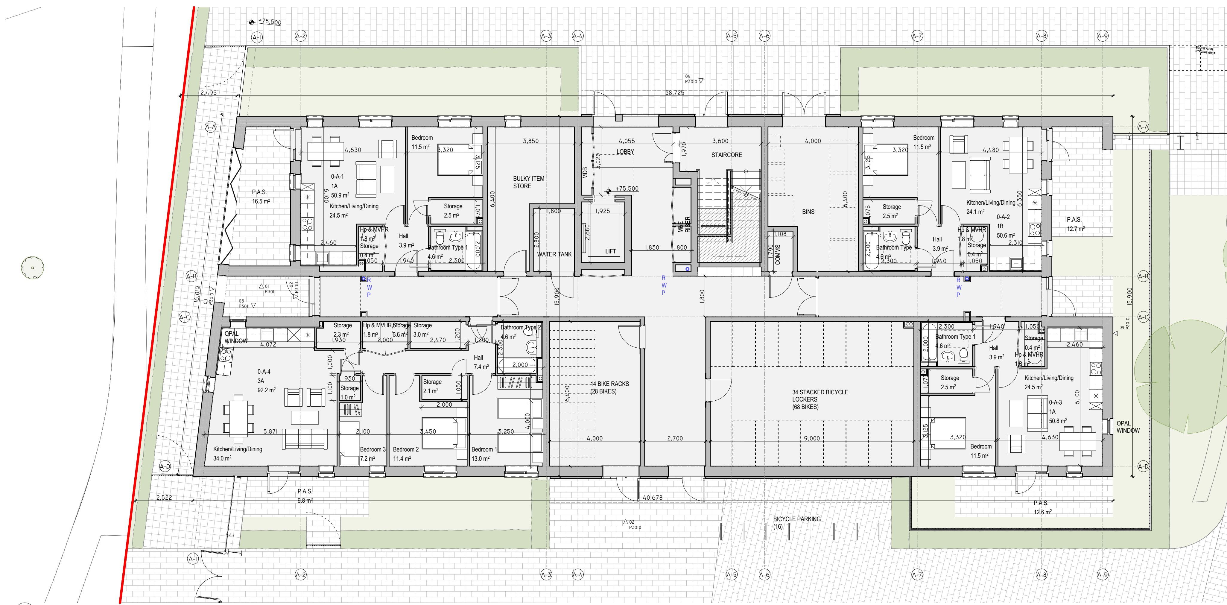
01 LEVEL 00 PI020 1:100