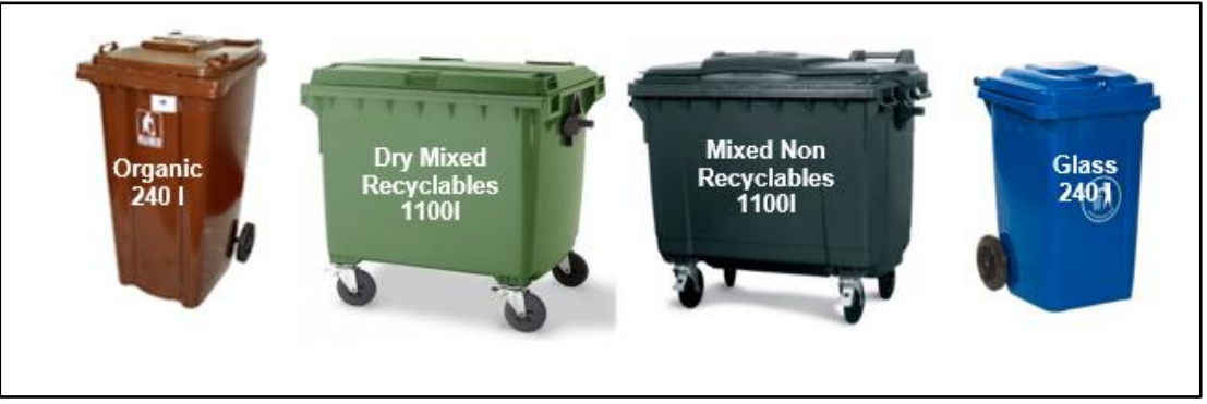
Figure 5.1 Typical waste receptacles of varying size (240L and 1100L)

The types of bins used will vary in size, design and colour dependent on the appointed waste contractor. However, examples of typical receptacles to be provided are shown in Figure 5.1. All waste receptacles used will comply with the SIST EN 840-1:2020 and SIST EN 840-2:2020 standards for performance requirements of mobile waste containers, where appropriate.