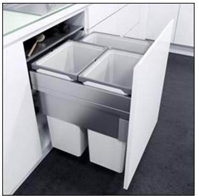
Figure 5.2 Example three bin storage system to be provided within the unit design

Residents will be required to take their segregated waste materials to their designated WSA and deposit their segregated waste into the appropriate bins. The locations of the shared residential WSAs are illustrated in the drawings submitted with the planning application under separate cover and in Appendix 1 of this report.