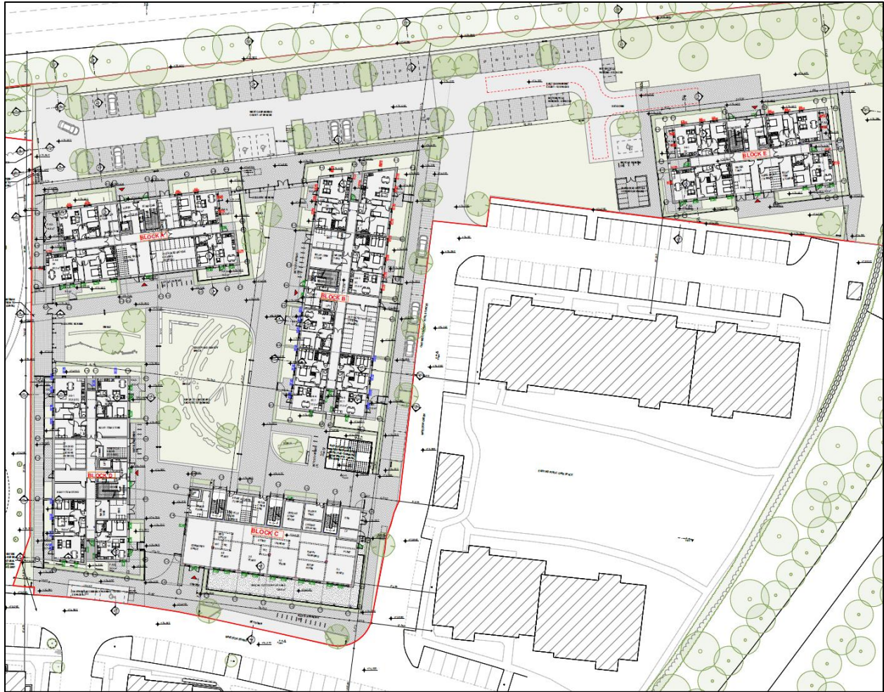
Figure 4.1 Proposed Site Layout Plan