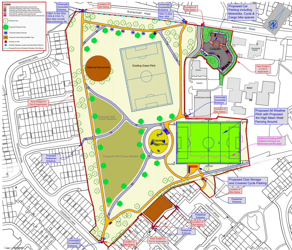
Figure 3 Plan of proposed upgrade works

(See accompanying drawing set for full scaled versions of all drawings.)