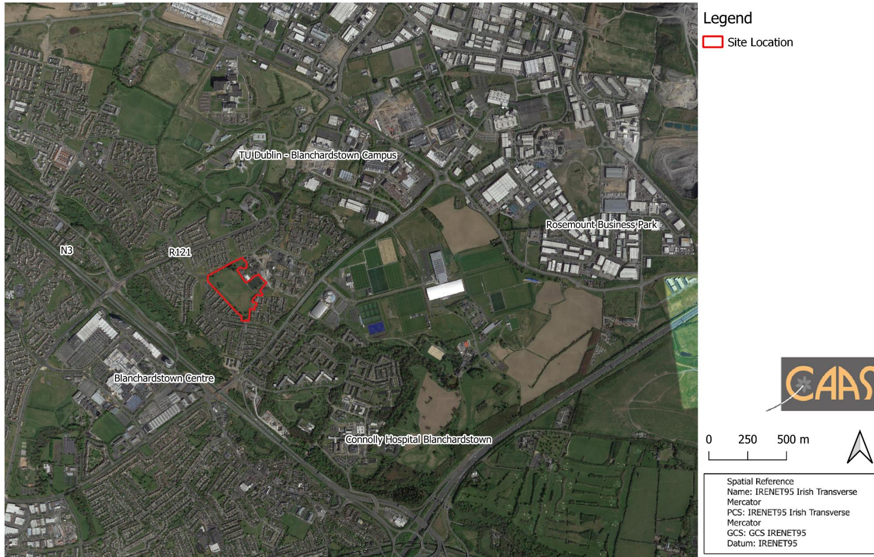
Figure 1 Site location map

(site boundary includes construction compound and is approximate)