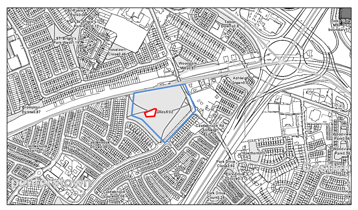
Image 1: Proposed Project Site Location inside the red line at Laurel Lodge Park