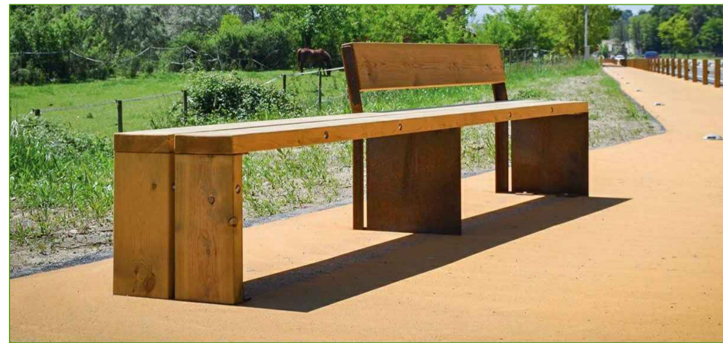
EXAMPLE OF BENCH TYPE 1

Index No.: 6033_10 Date: Nov, 2023 Scale 1:20@A1