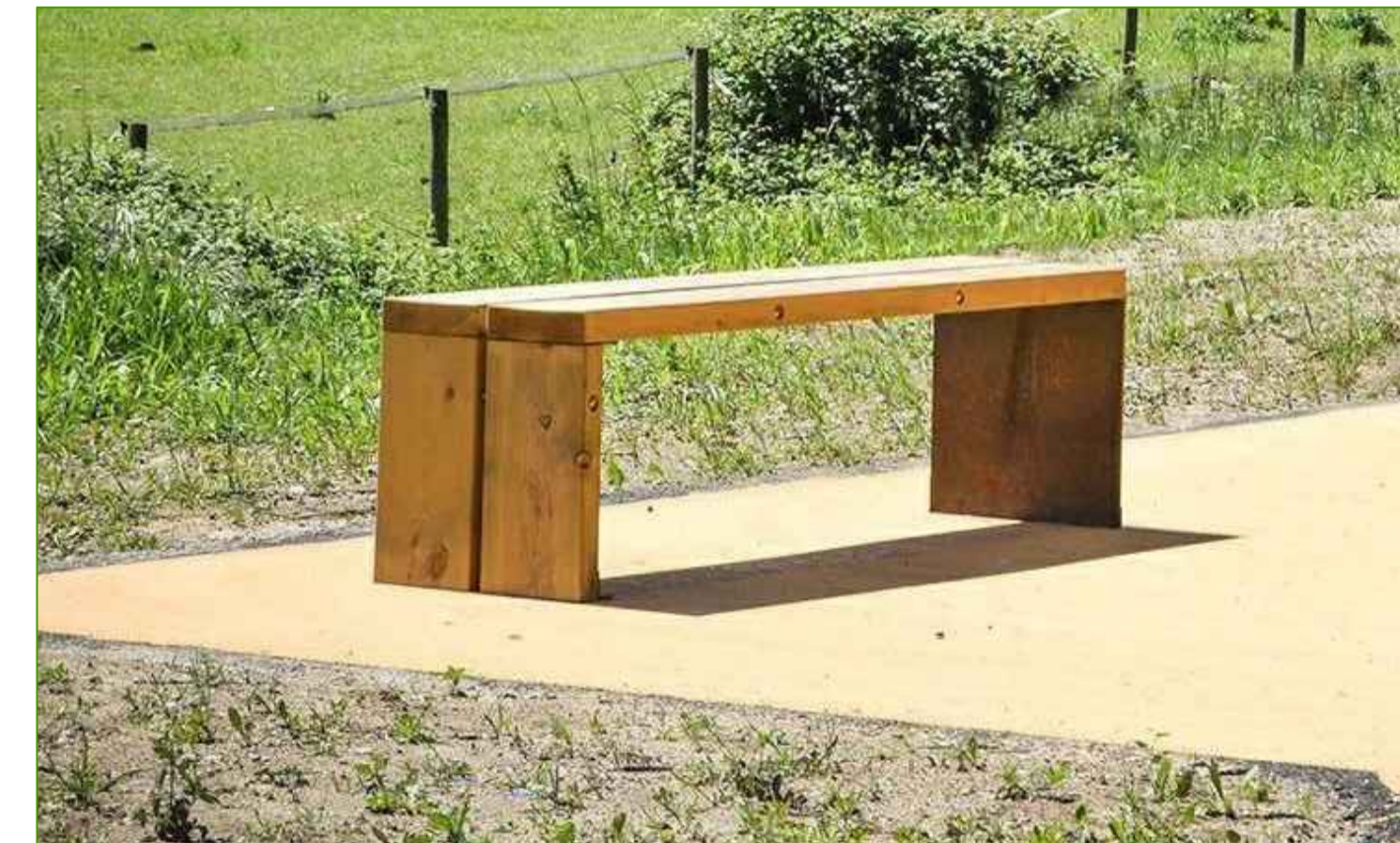
EXAMPLE OF BENCH TYPE 2