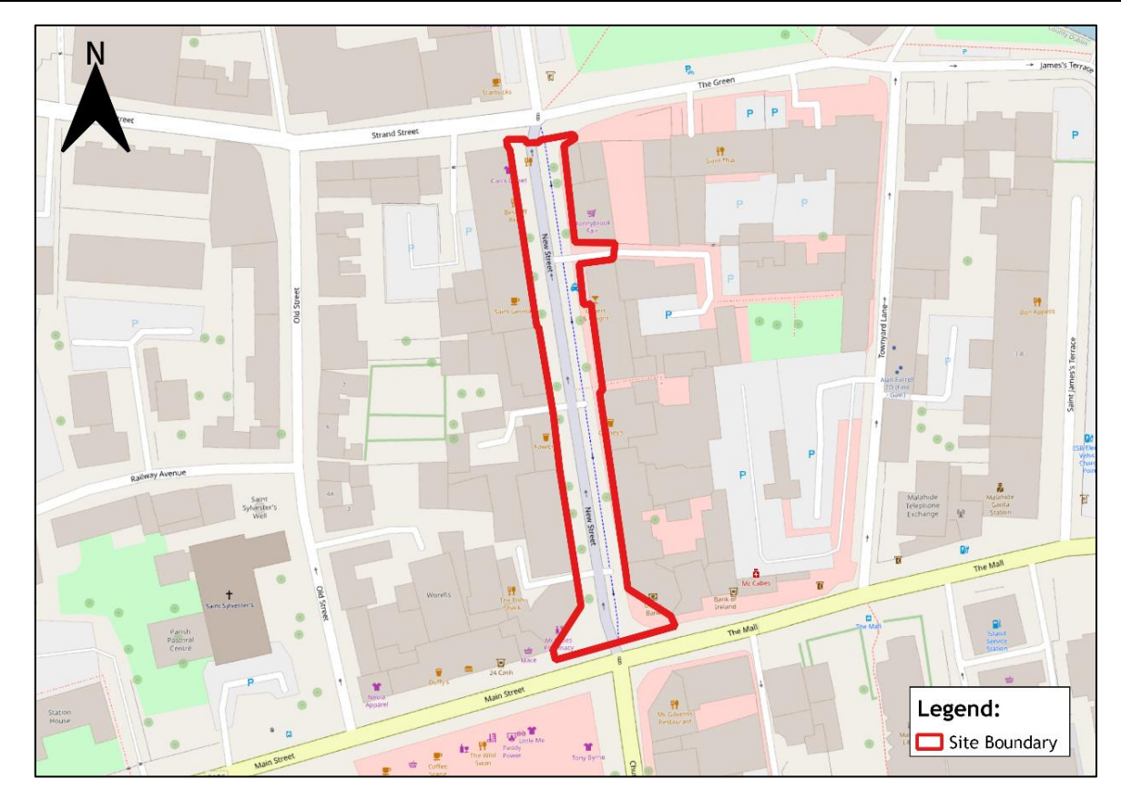
Figure 1-1: Site Location