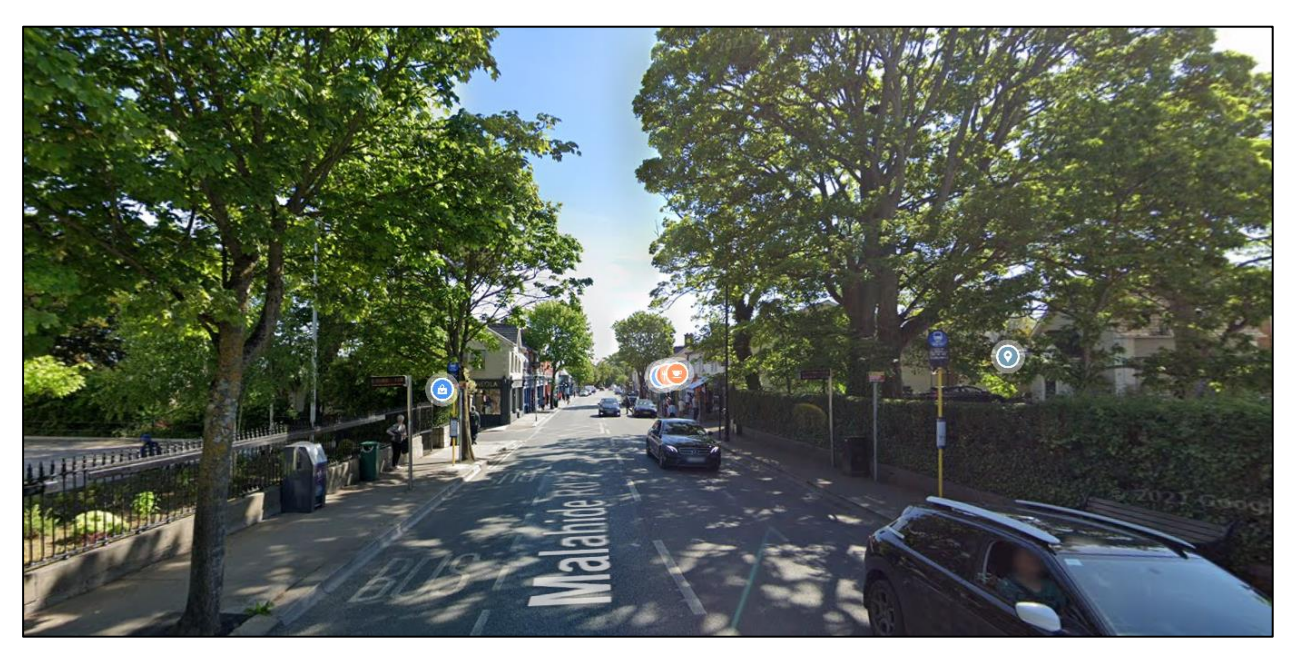
Figure 4-1: Dublin Road (R106) Heading eastward towards junction with New Street.

The management of construction traffic on the public road network around the development will be a critical part of the overall proposed public realm improvements and must be actively managed by the Contractor.