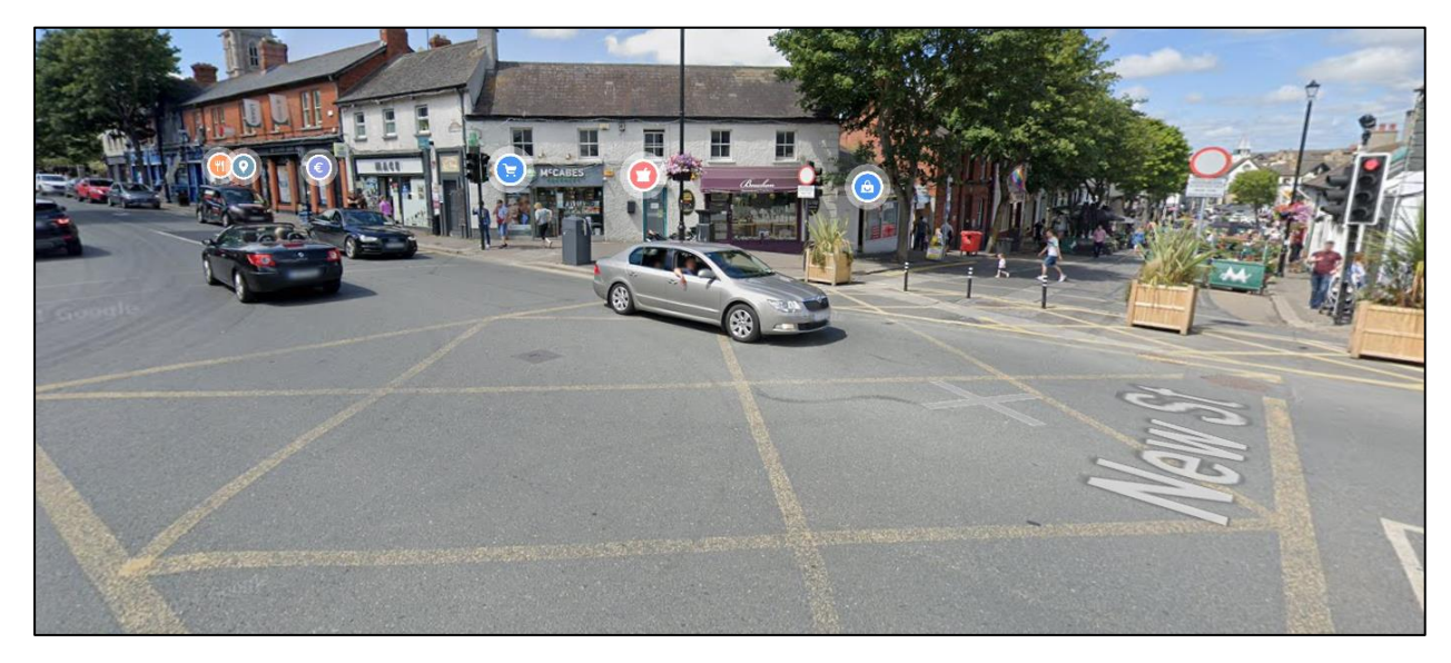
Figure 4-2: Dublin Road (R106) junction with New Street.