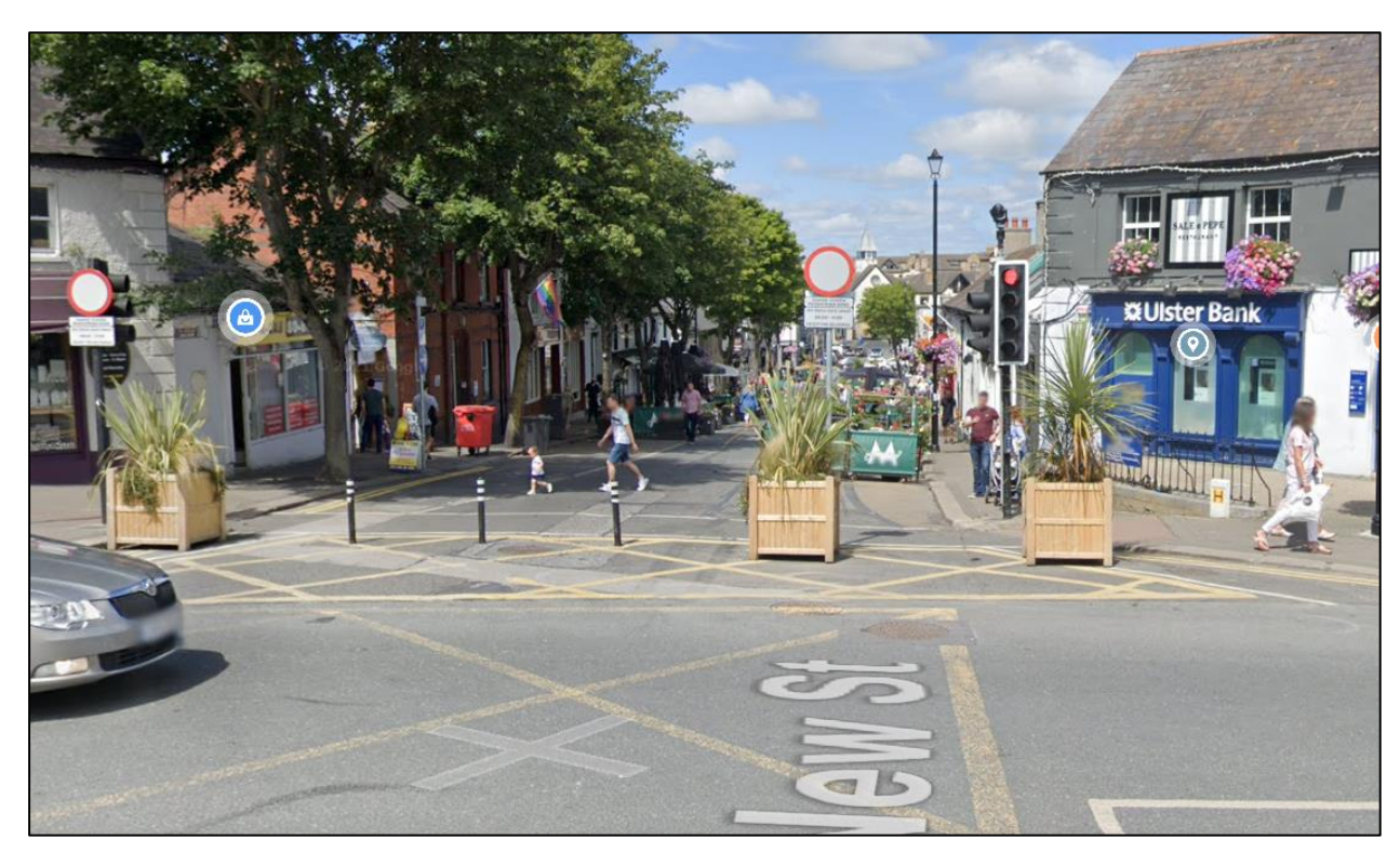
Figure 4-3: Proposed site access looking northwards on New Street.