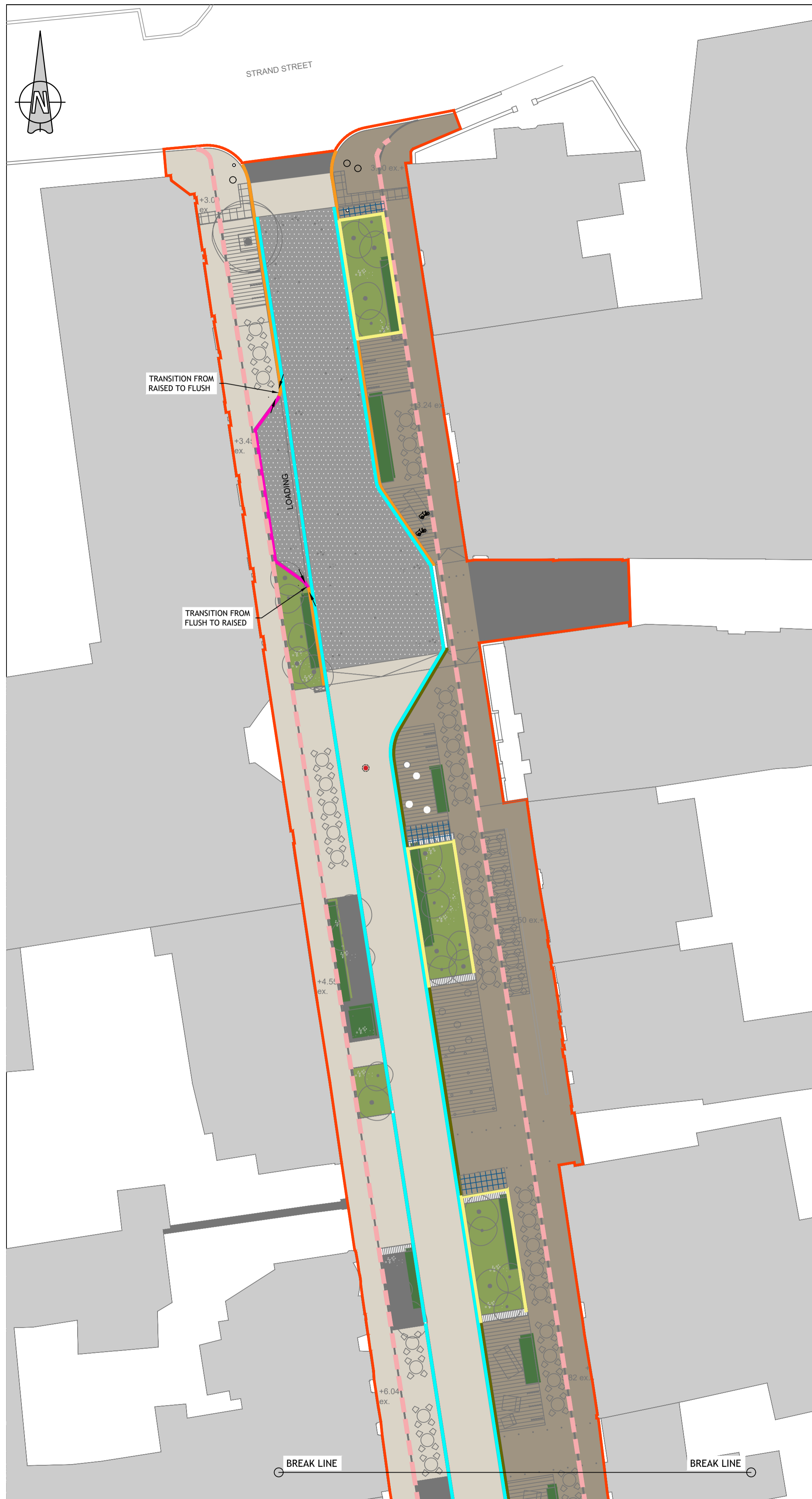
PLAN VIEW 1 SCALE 1:200