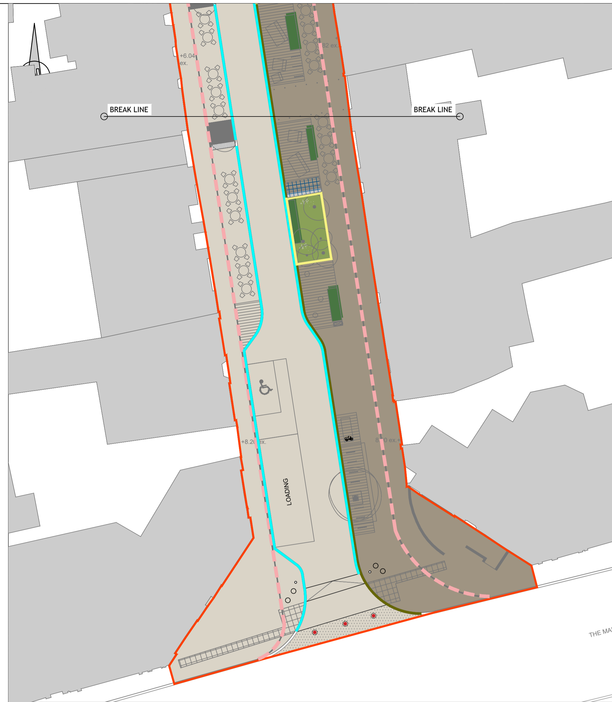
PLAN VIEW 2 SCALE 1:200