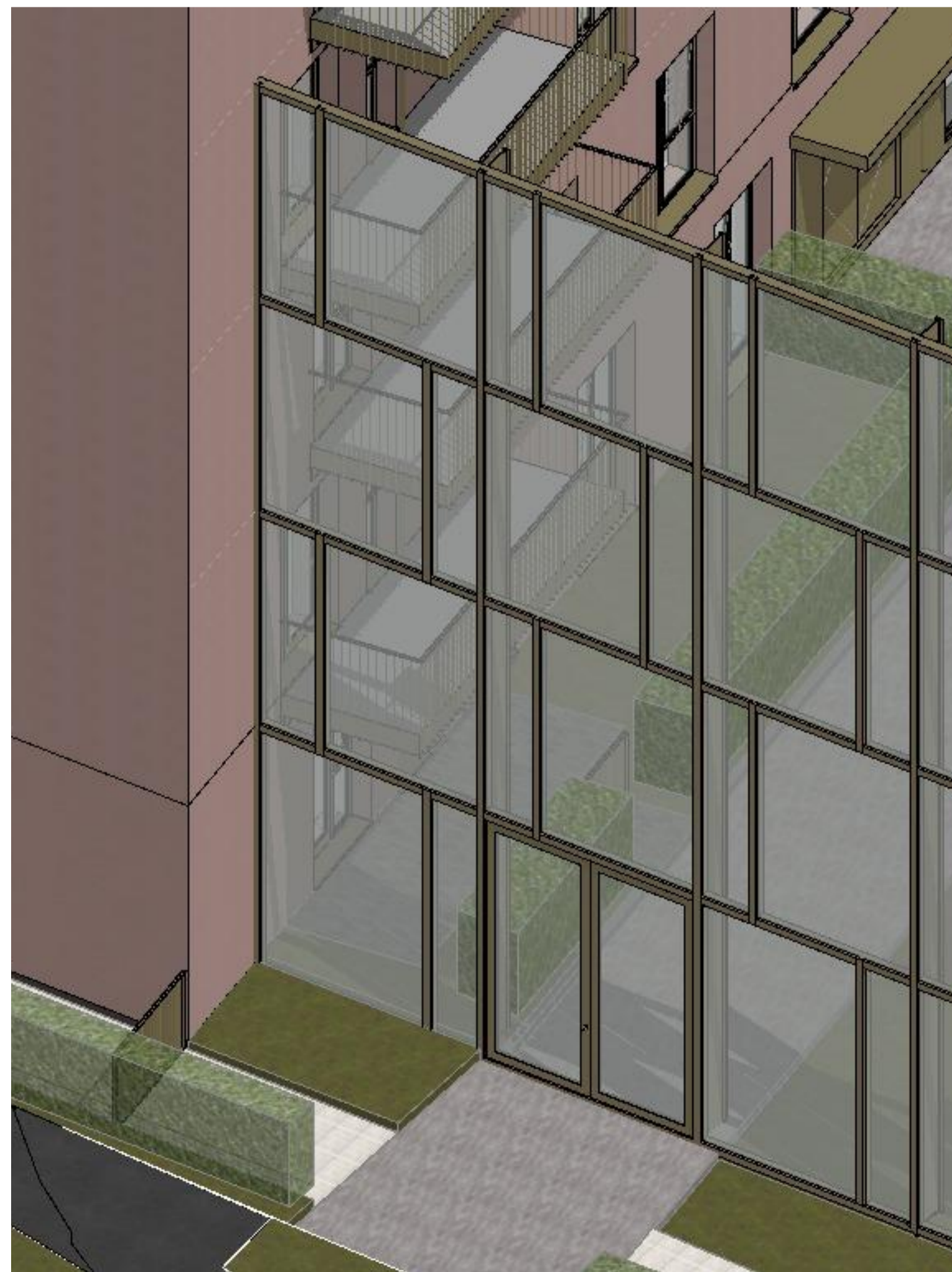
3D AXO ACOUSTIC SCREEN P403 1:10