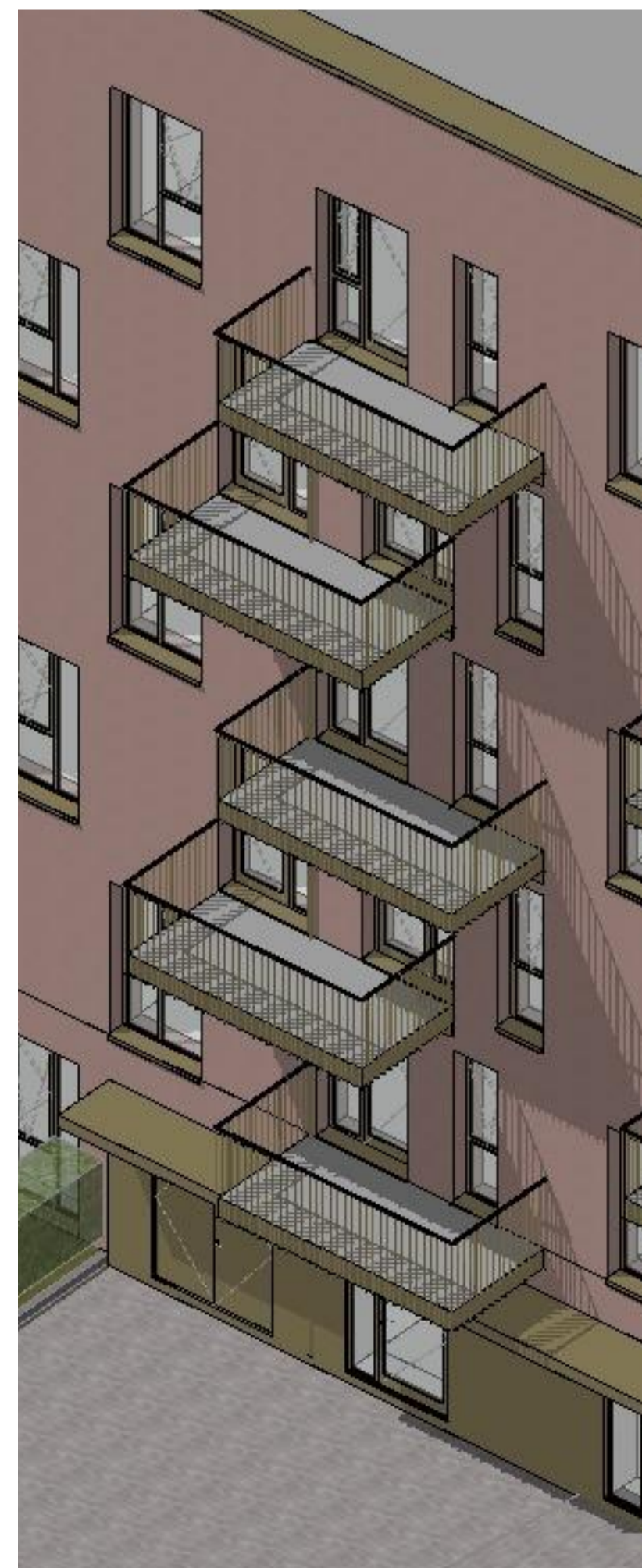
P4.02 3D AXO BALCONY AND ENTRANCE AREA 1:10