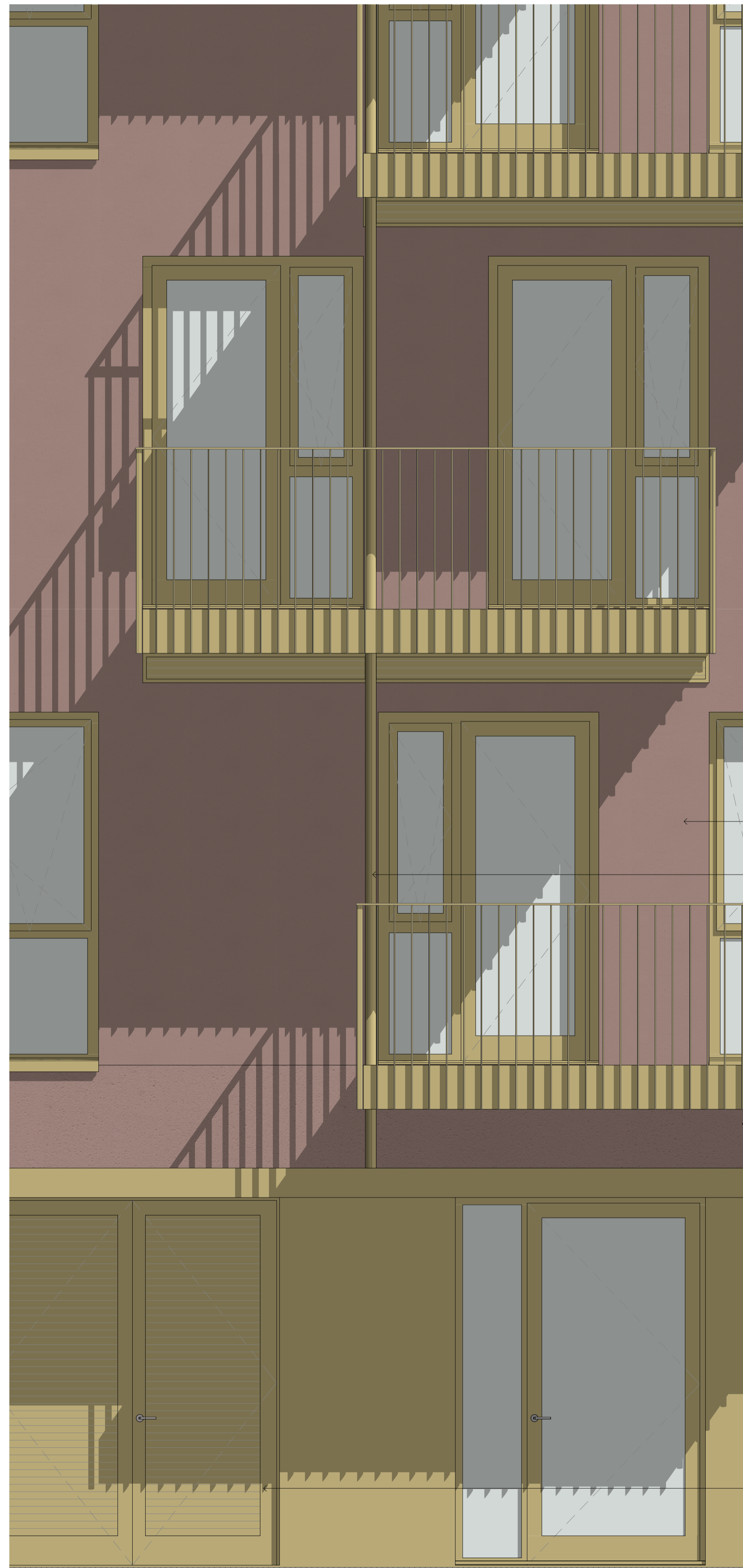
E-14 BALCONY ELEVATION P4.02 1:20