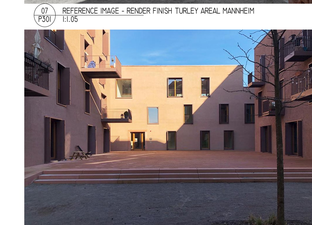
REFERENCE IMAGE - RENDER FINISH TURLEY AREAL MANNHEIM 1:2.81