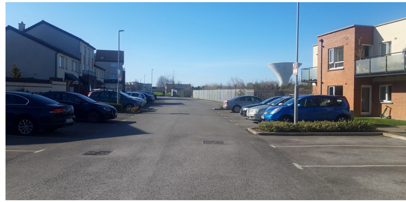
VIEW OF SITE FACING EAST ALONG MAYESTON DOWNS