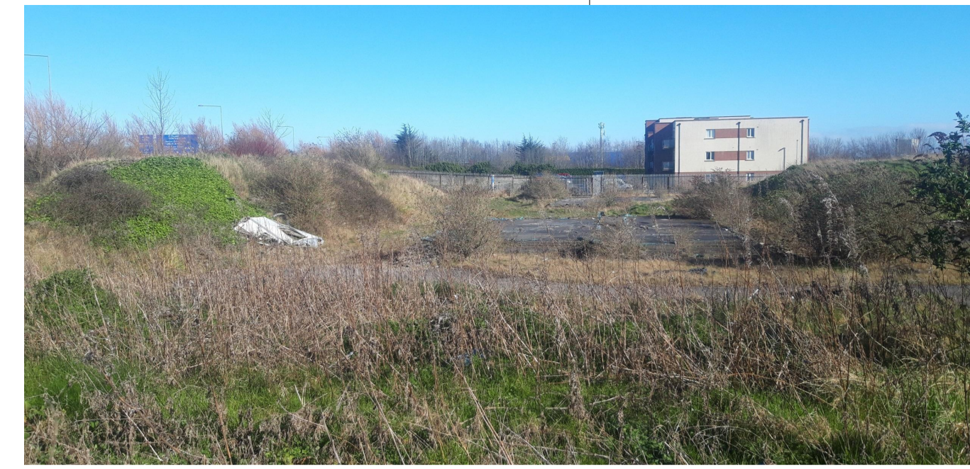
VIEW OF SITE FACING WEST TOWARDS MAYESTON GREEN