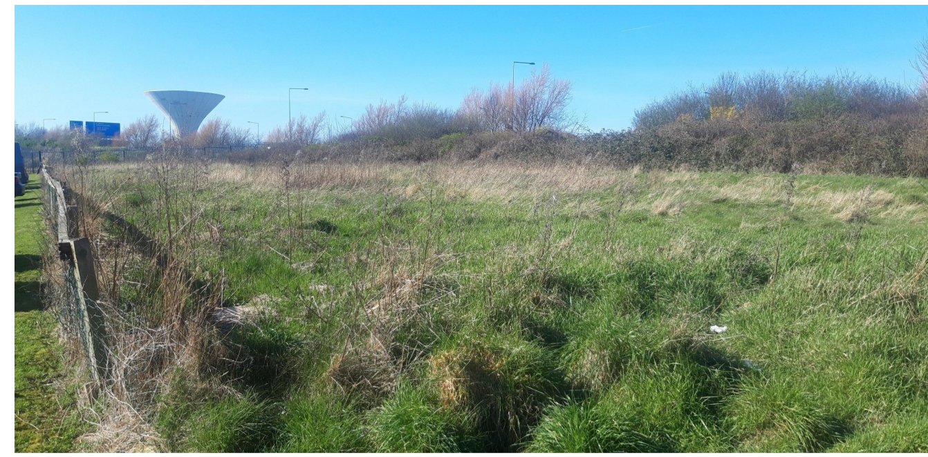
VIEW OF NORTH-EASTERN PART OF SITE, FACING EAST