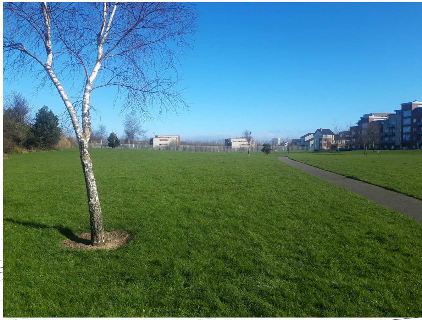
VIEW FROM PUBLIC OPEN SPACE, FACING EAST TOWARDS SITE