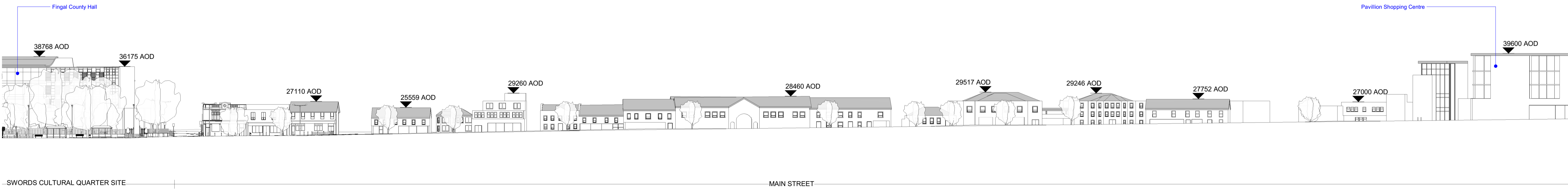
1. North Street - Main Street Continued (West Elevation) 1 : 500