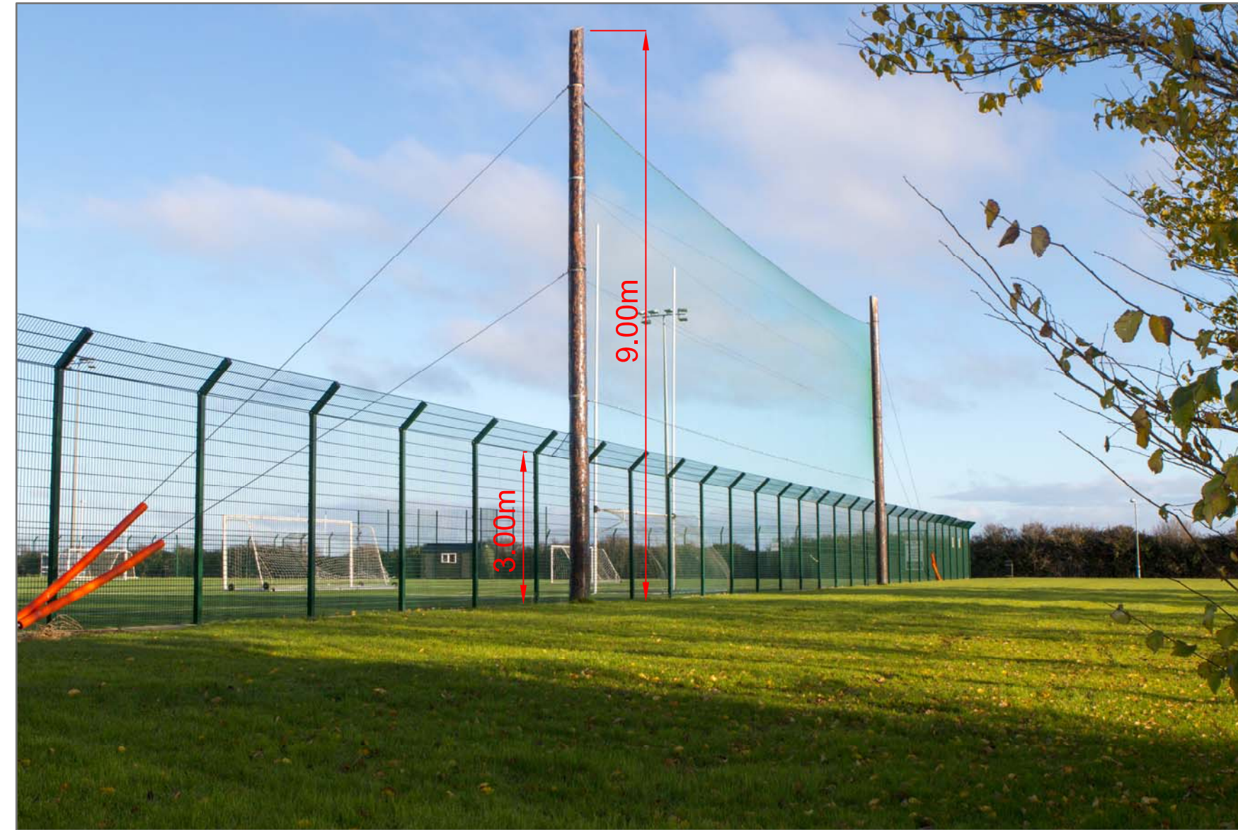
Ball Stop Netting.