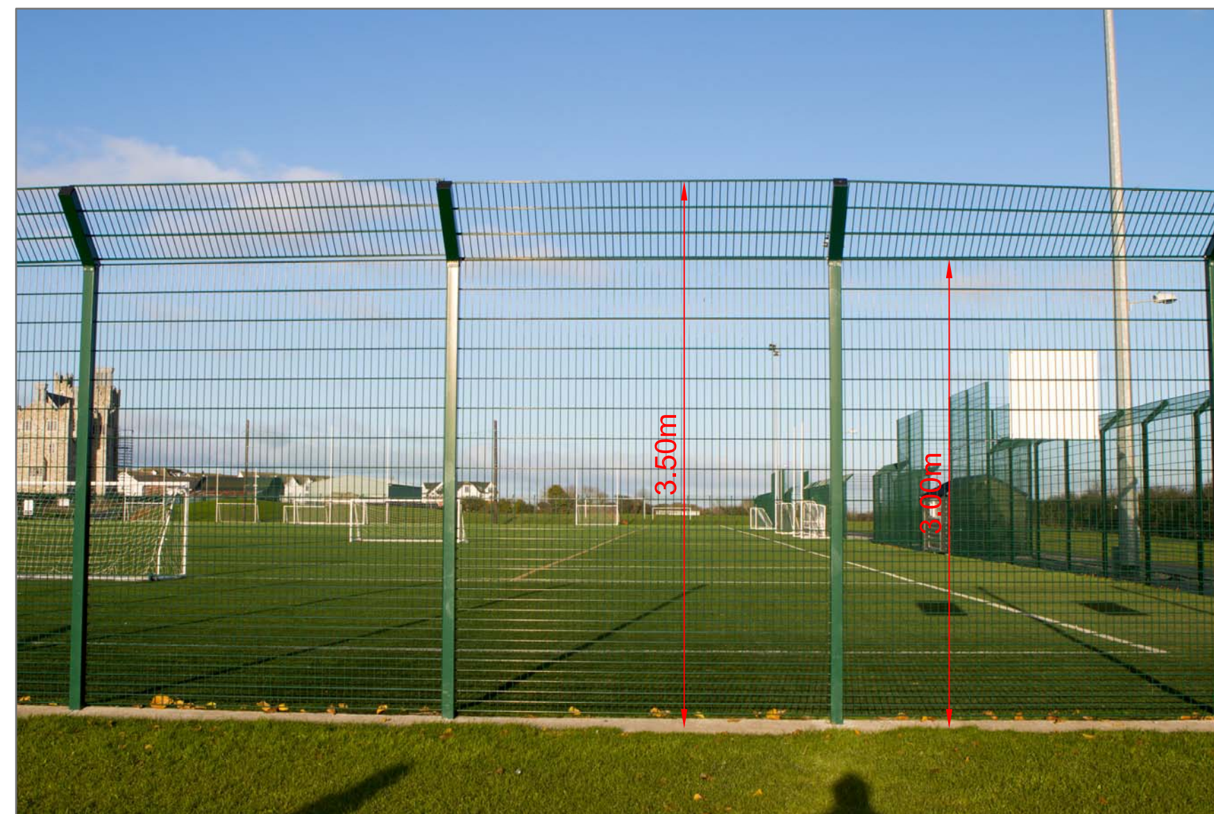
Weld Mesh Fencing.