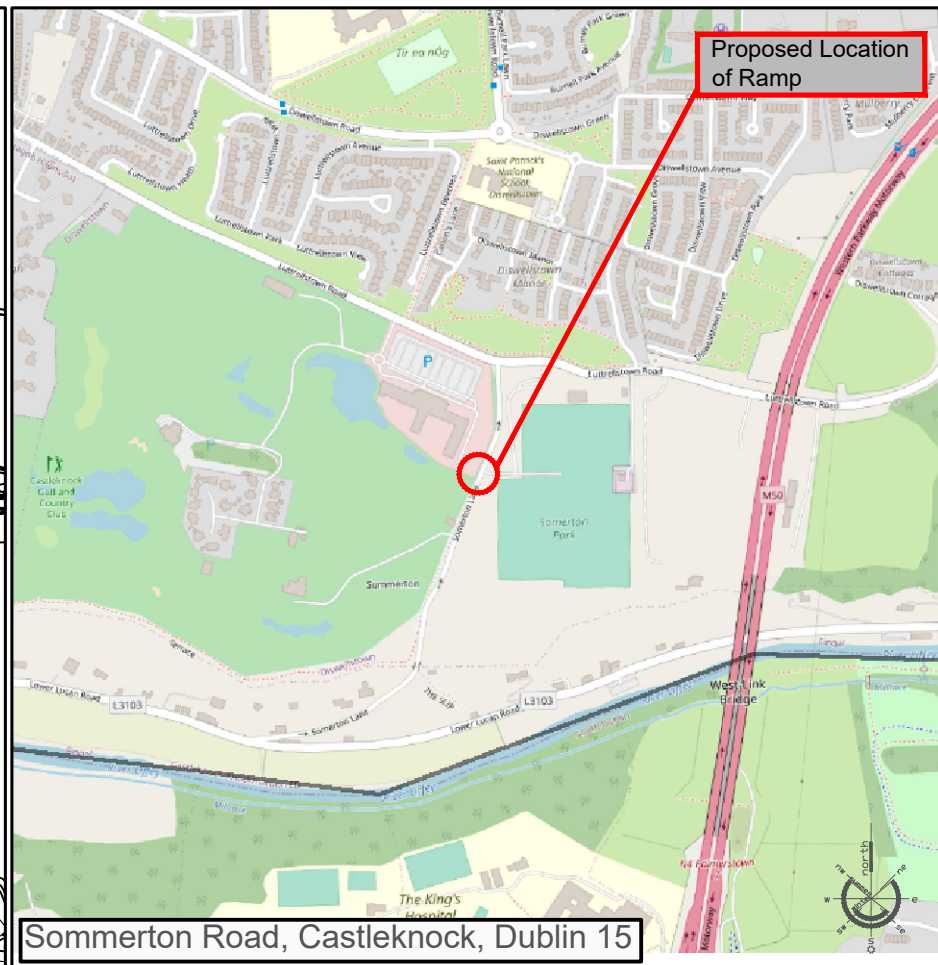
Somerton Road, Castleknock, Dublin 15 Site Location Map Not to Scale