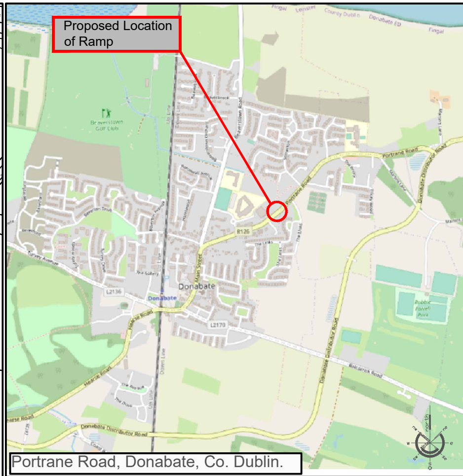
Portrane Road, Donabate, Co. Dublin. Site Location Map Not to Scale