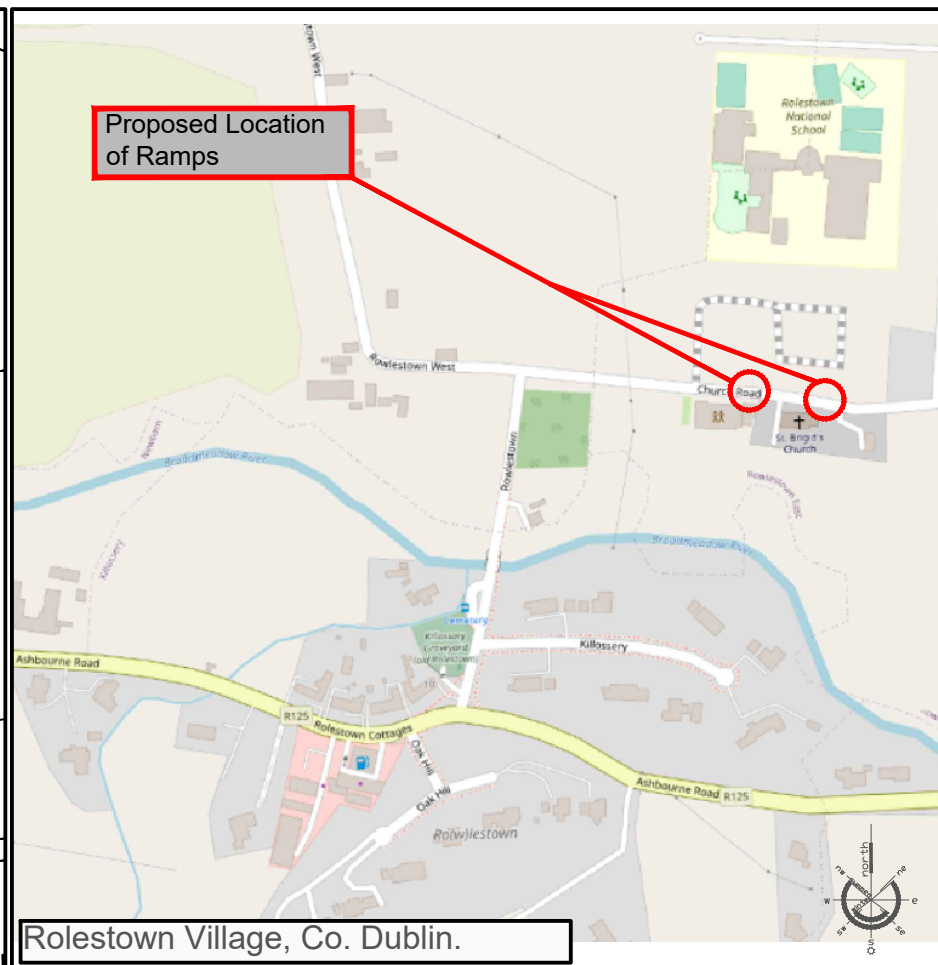
Rolestown Village, Co. Dublin. Site Location Map Not to Scale