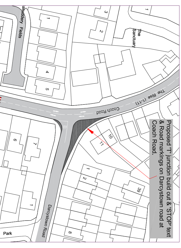
View 2 - Proposed Junction at Darcystown Road Not to Scale