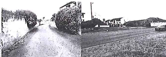
View 2 Exit